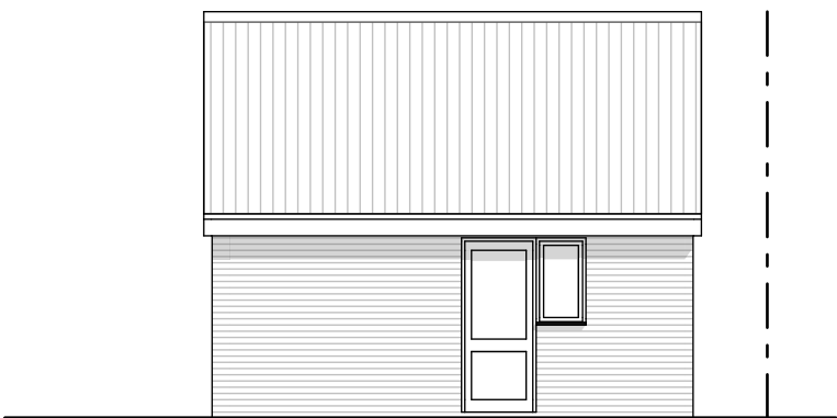
GARAGE REAR ELEVATION 1:100