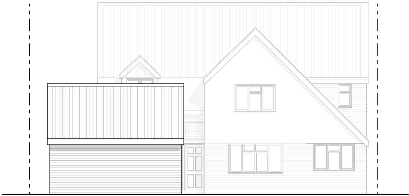
PROPOSED FRONT ELEVATION 2 1:100