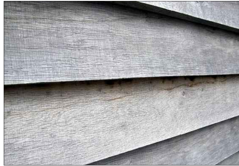
PHOTOGRAPH SHOWING PROPOSED WALL MATERIAL: NATURAL OAK, ROUGH SAWN 200x20mm PLANKS, LEFT TO WEATHER NATURALLY