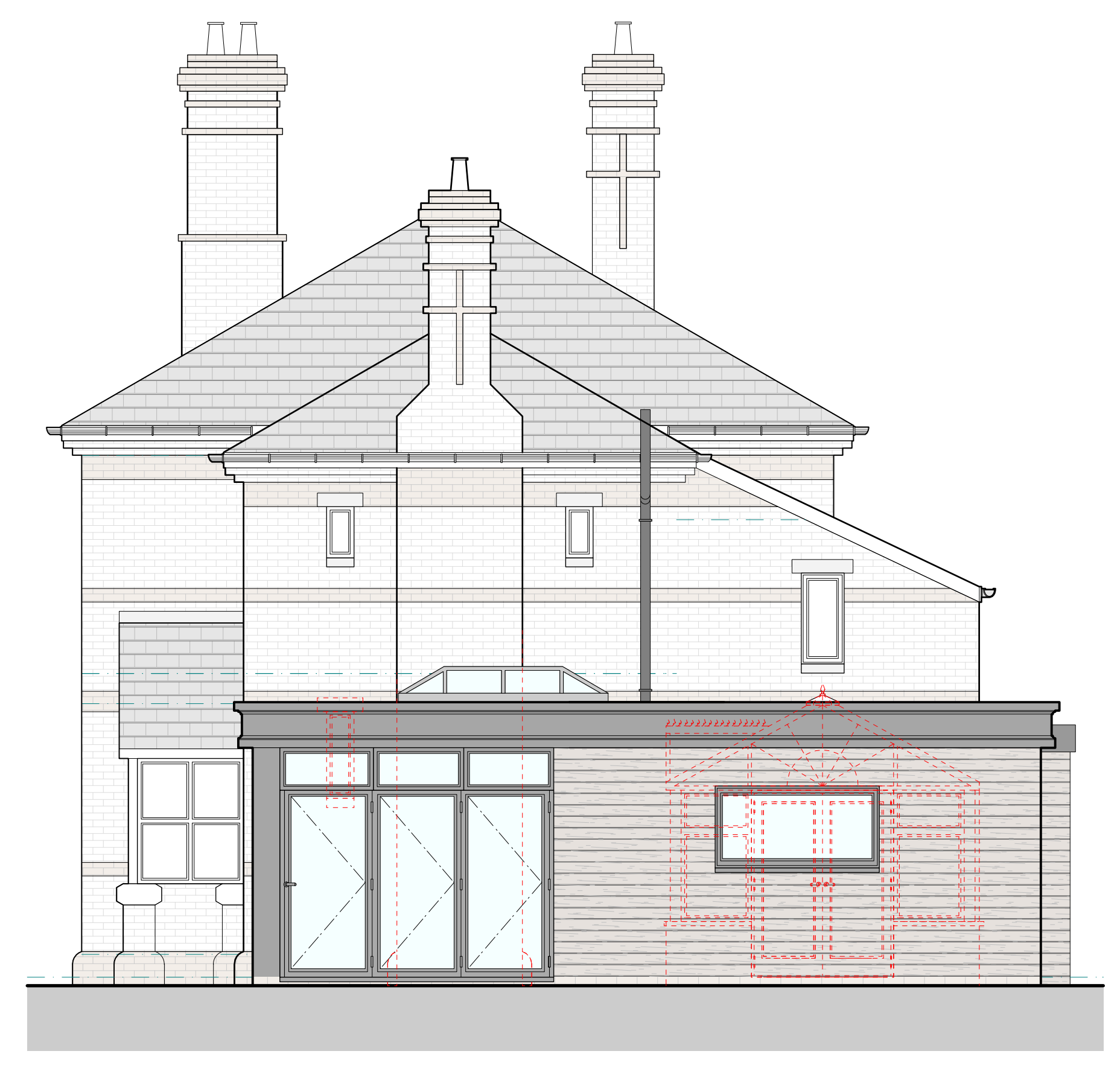
East Elevation 1:50