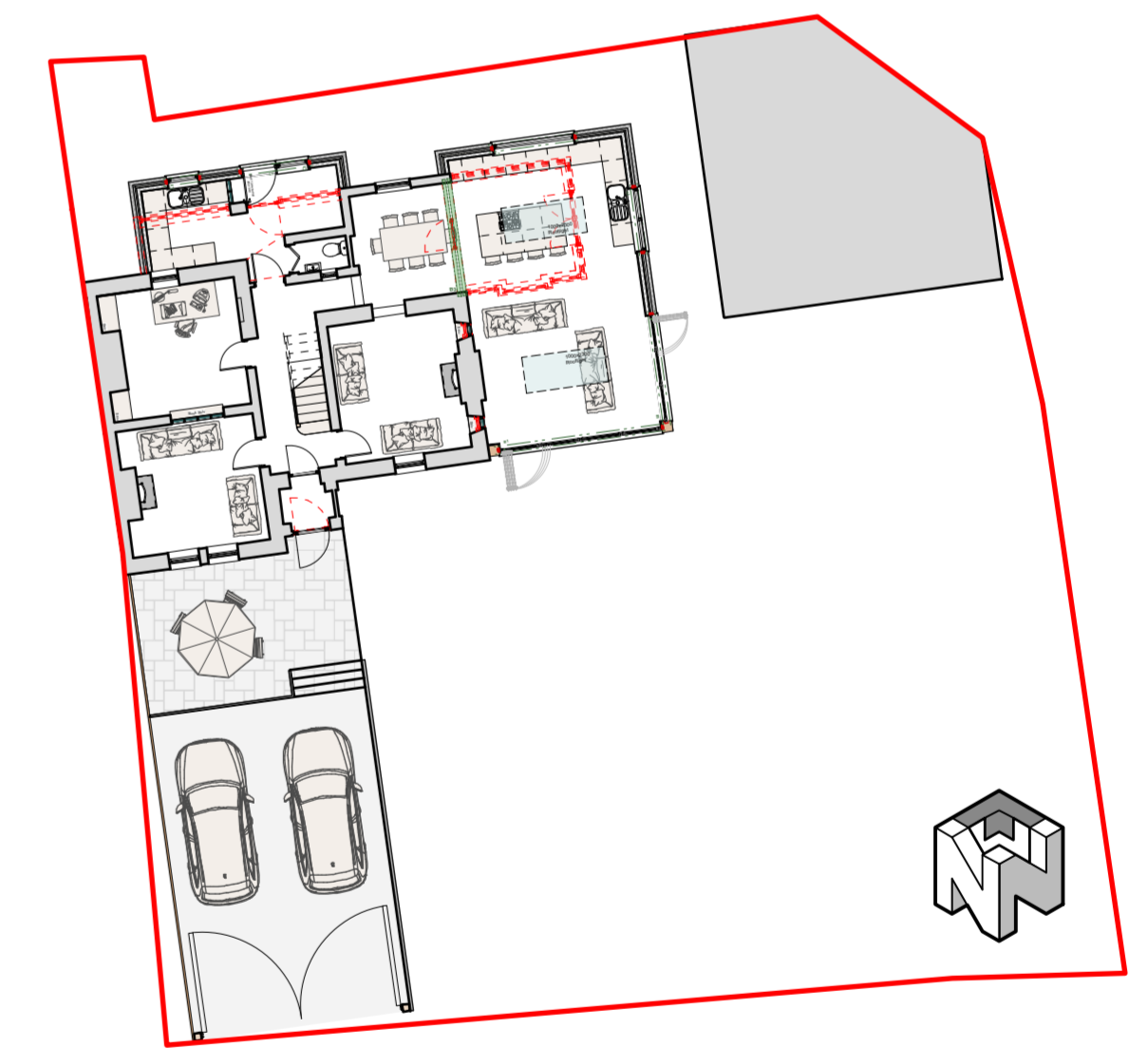
Block Plan 1:200 Scale in metres 1:200 0 5 10 15