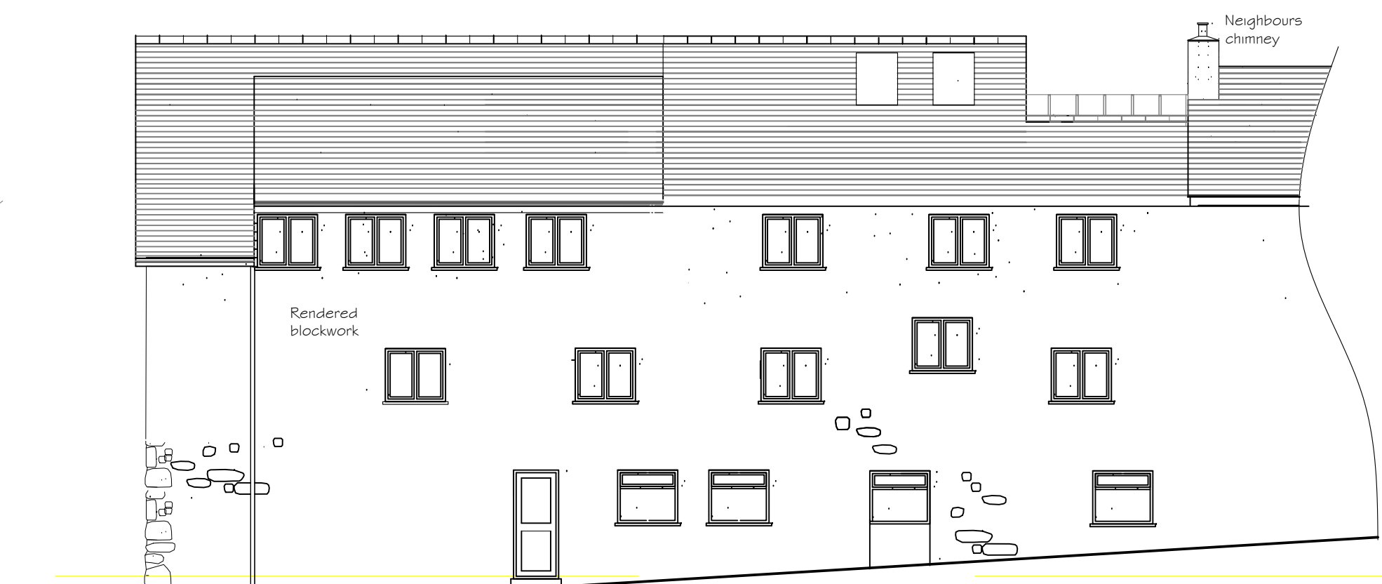
SCALE 1::100 EXISTING EAST ELEVATION