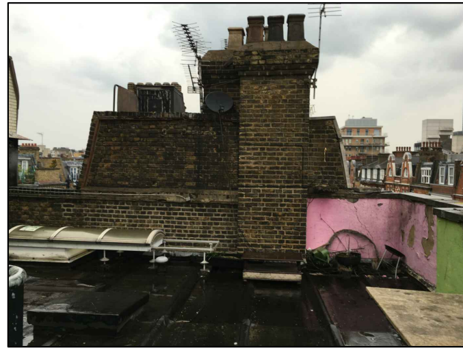
EXISTING FLAT ROOF