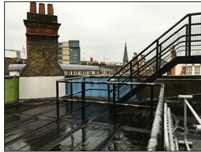
EXISTING ROOF FIRE ESCAPE