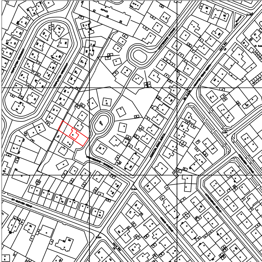
LOCATION PLAN SCALE 1/1250