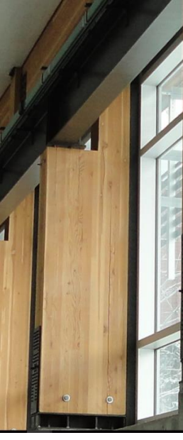
Materials with low embodied carbon such as straw, local stone an timber all add to the depth of external walls.