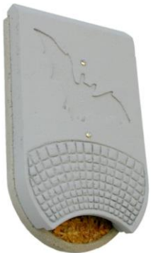
Schwegler 1FQ Bat box