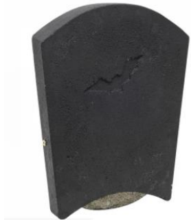
Beaumaris Woodstone Bat Box