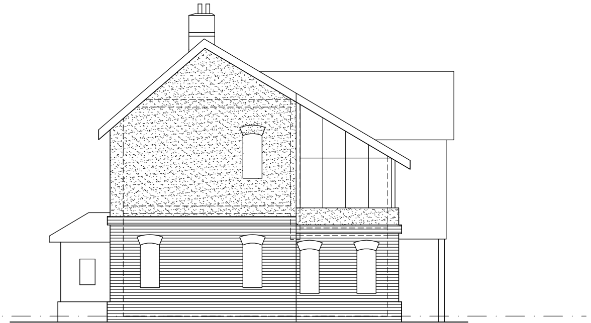
EXISTING EAST ELEVATION 1:100@A3