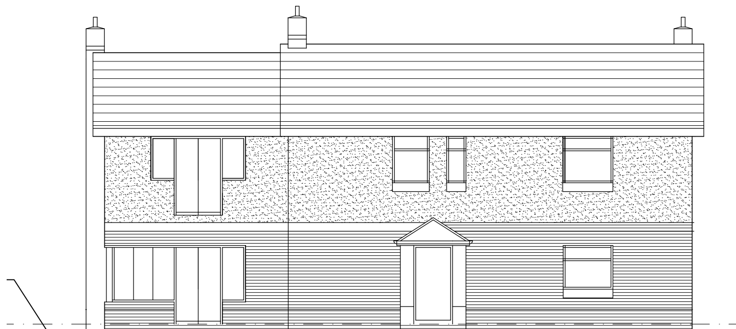
EXISTING SOUTH ELEVATION 1:100@A3