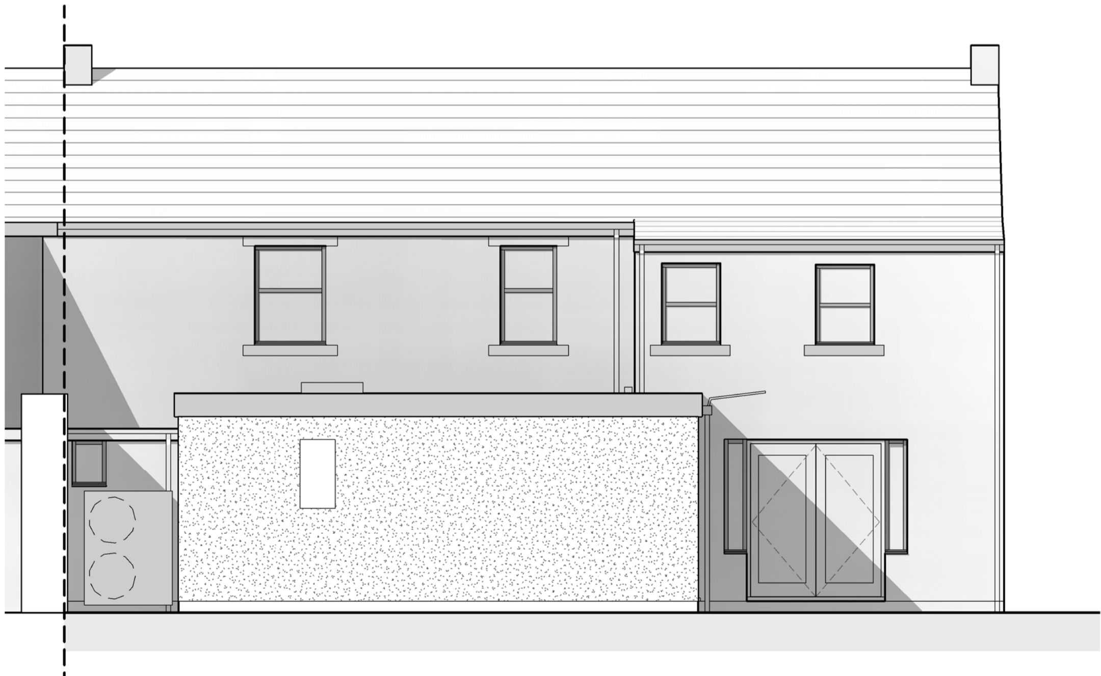
Proposed Rear Elevation 1 : 50