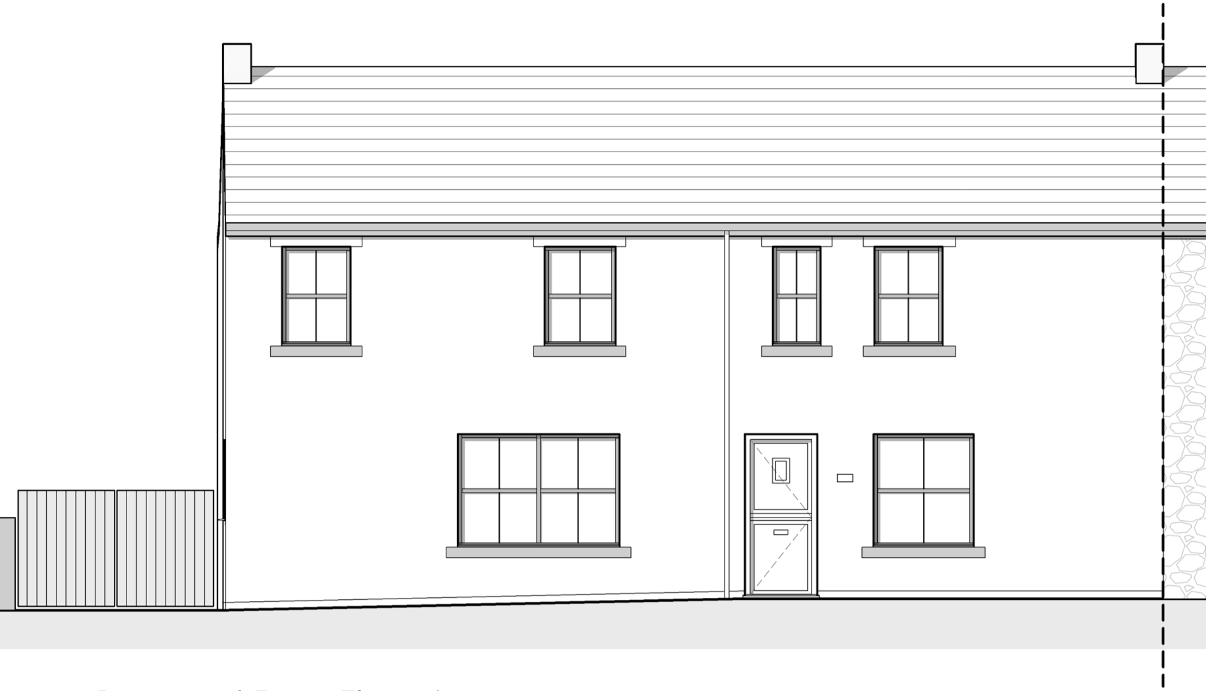
Proposed Front Elevation 1 : 50

The use of this document / drawing, and the information therein, is an acceptance of the following statements: This document is copyright and must not be reproduced, completely or in part, without the consent of Seymour Architecture Ltd. The controlled version of this document / drawing should be viewed in PDF. This document / drawing may be based upon information supplied by third parties and as such their accuracy cannot be guaranteed. This document / drawing may be based upon the requirement to be read in conjunction with other documentation and thus may not be relied upon solely. Any discrepancies in document / drawing should be reported in writing to Seymour Architecture before proceeding. All work must be carried out in accordance with current and relevant statutory and regulatory standards including Construction (Design & Management) Regulations. This document / drawing was generated from the model: 368-SArch-S2-OP1-M3-A-Building_Central-220116