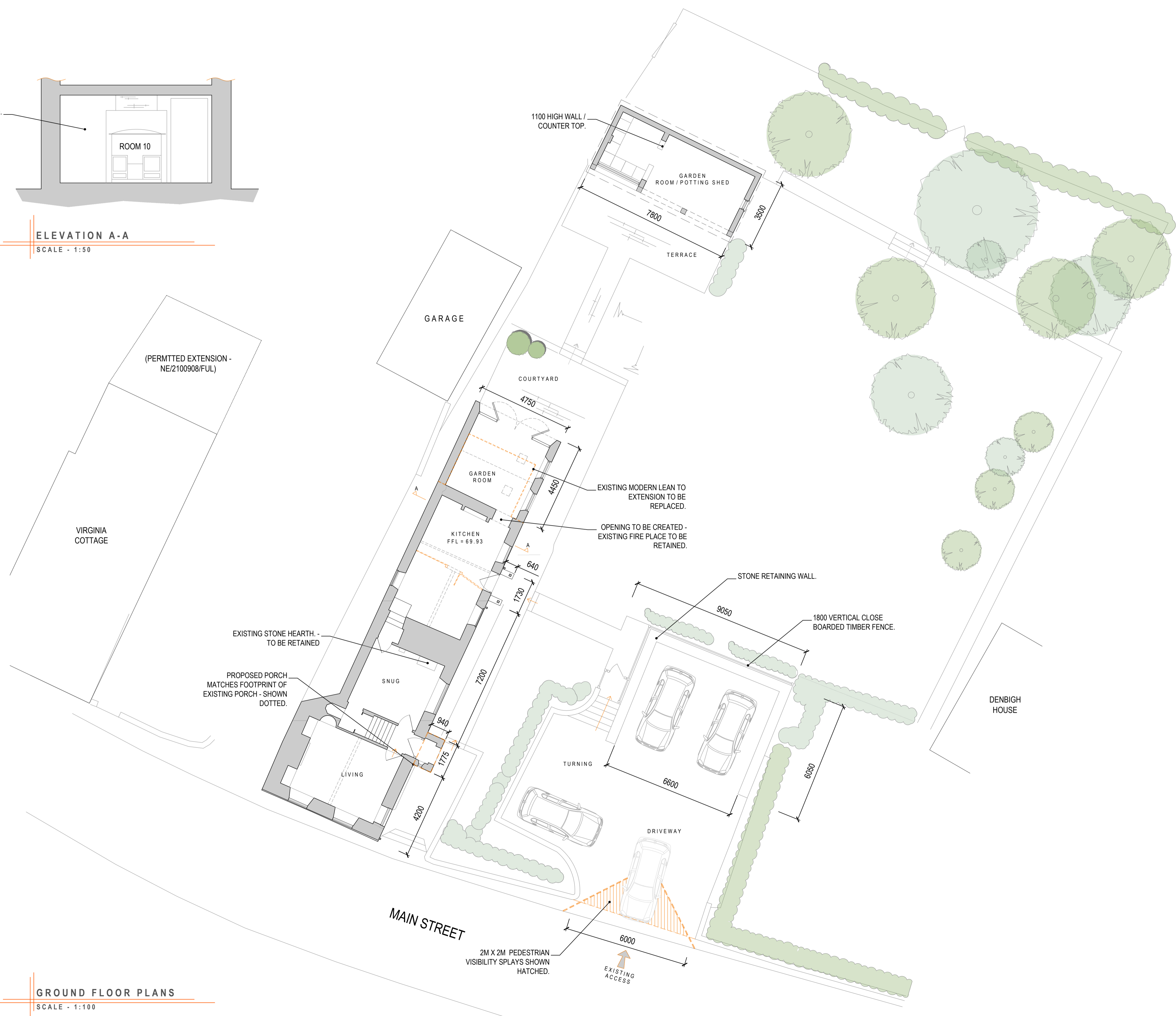
GROUND FLOOR PLANS