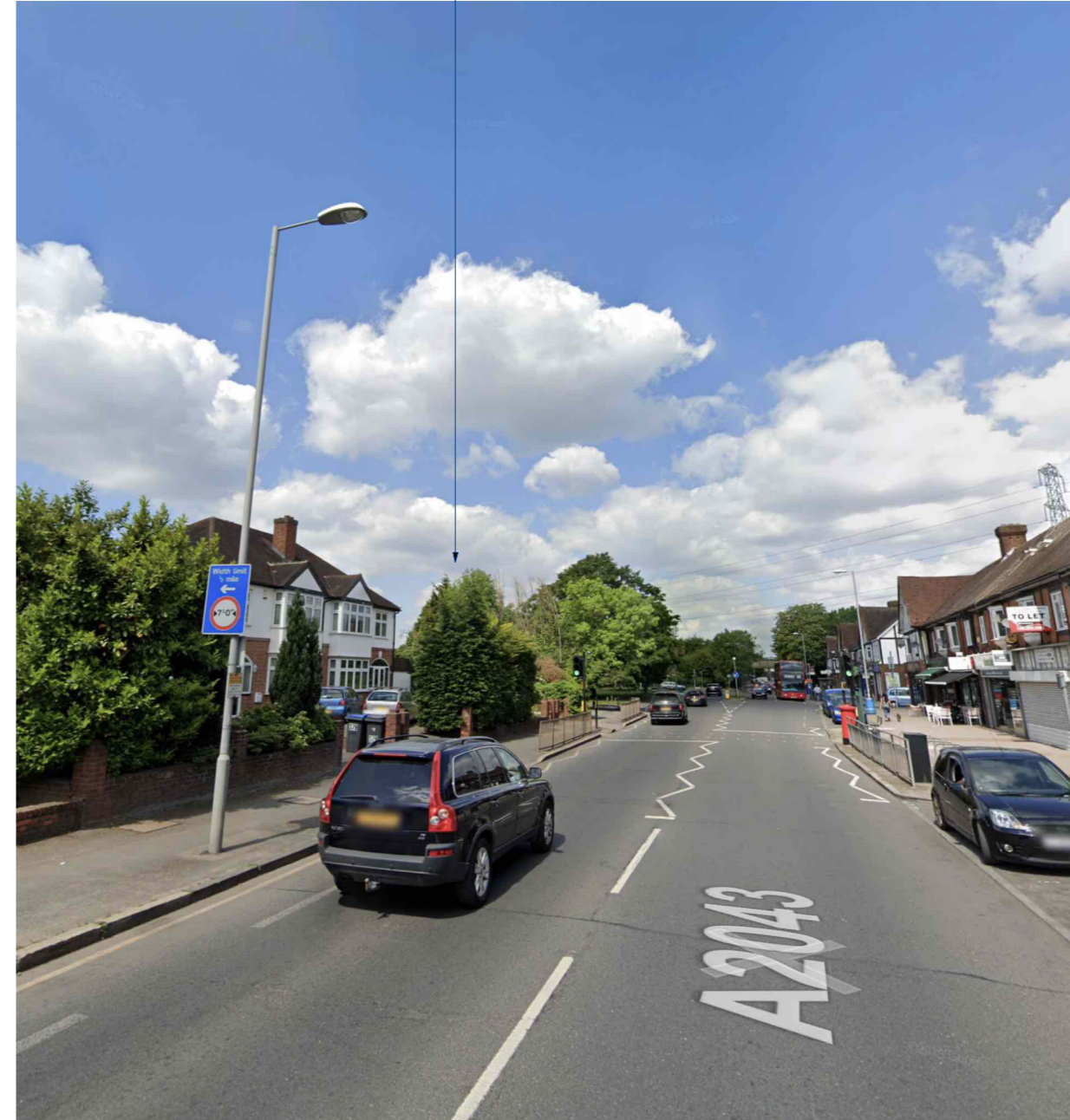
Direction from Worcester Park