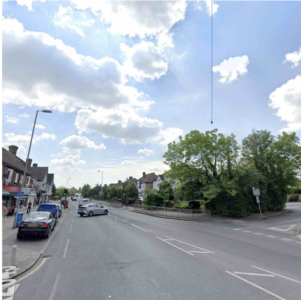
Direction from New Malden