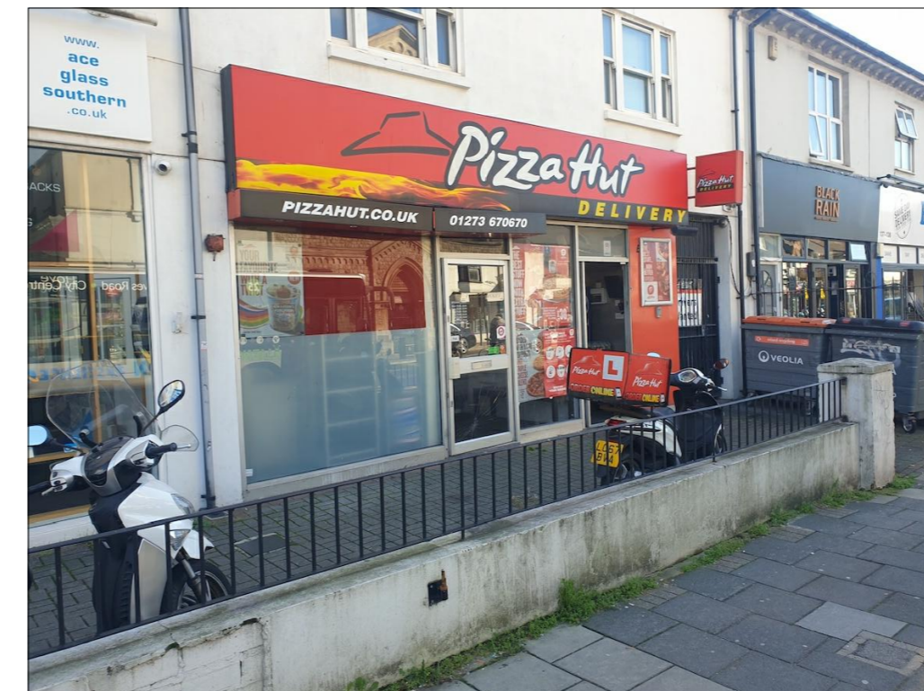
02 PHOTO AS EXISTING NTS