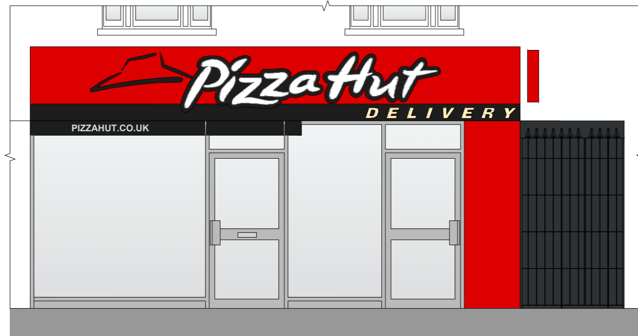
01 EXISTING SHOPFRONT 1:50