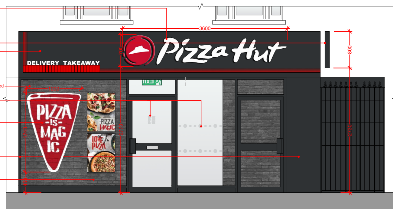
03 PROPOSED SHOPFRONT 1:50

AW ARCHITECTURAL DESIGN 1 The Willows, Mill Farm Courtyard, Beachampton, Milton Keynes, Buckinghamshire, MK19 6DS T: 01525 240800 E: admin@aw-architectural.co.uk W: www.aw-architectural.co.uk