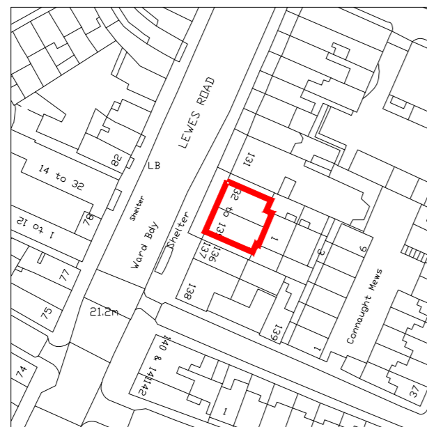
01 LOCATION PLAN 1:1250