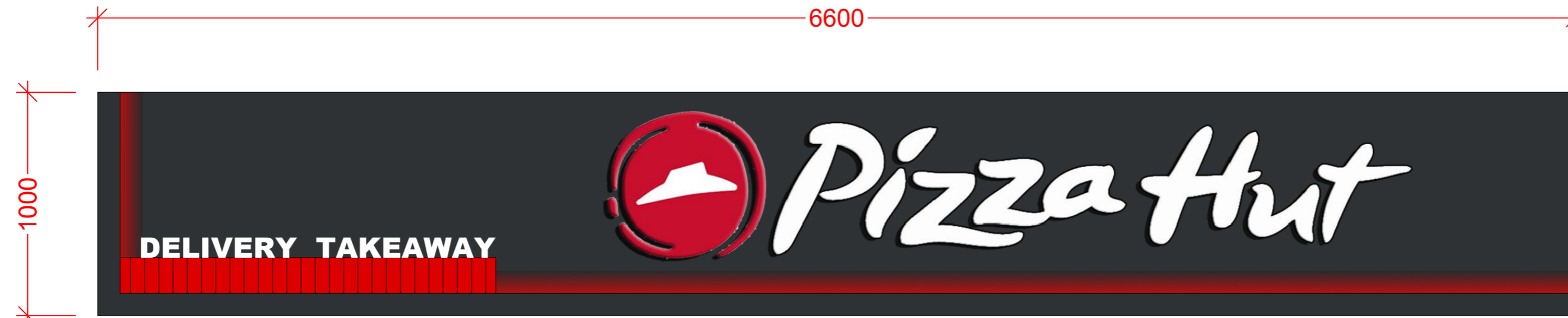
01 PROPOSED FASCIA SIGN 1:20