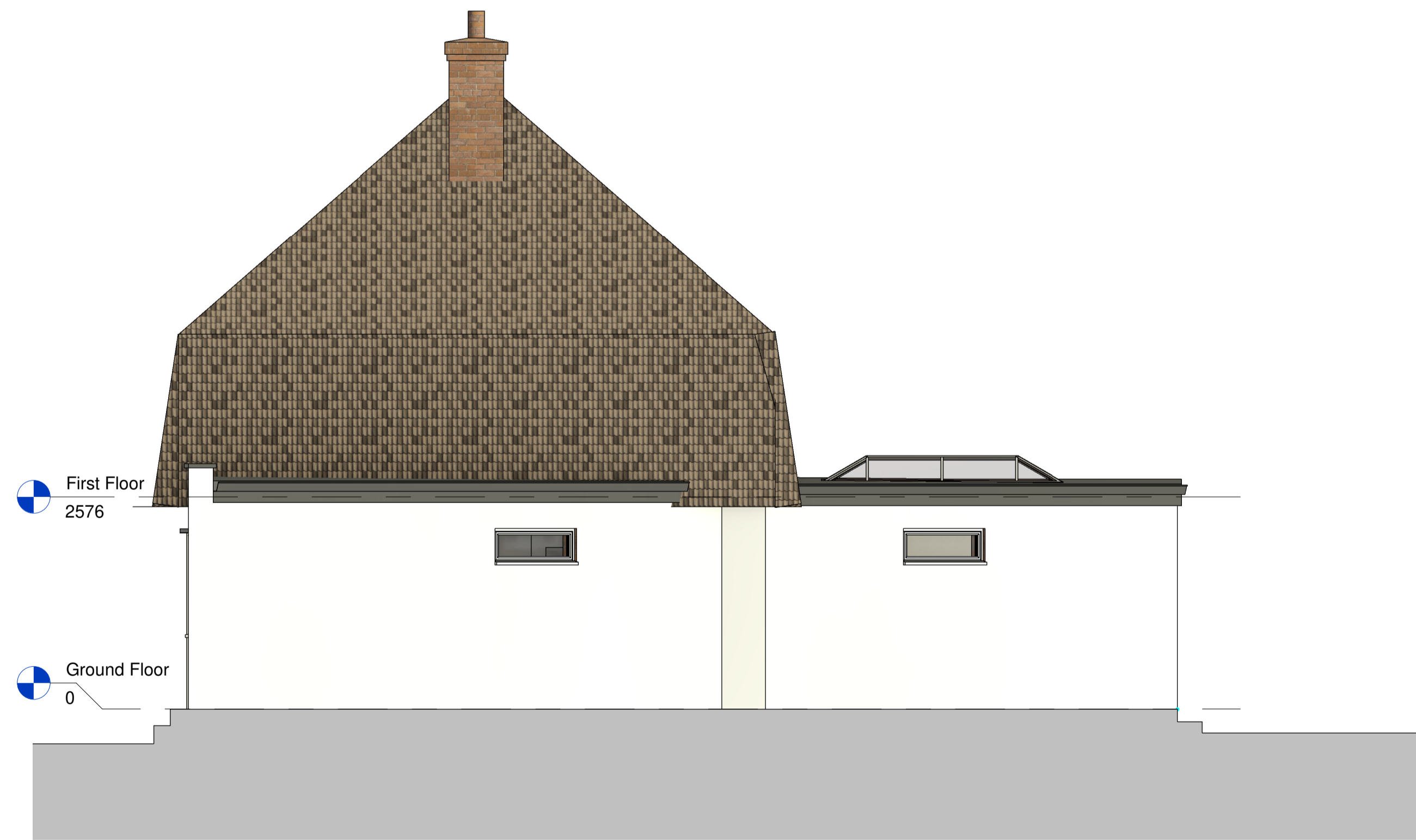
Right Elevation 1 : 50