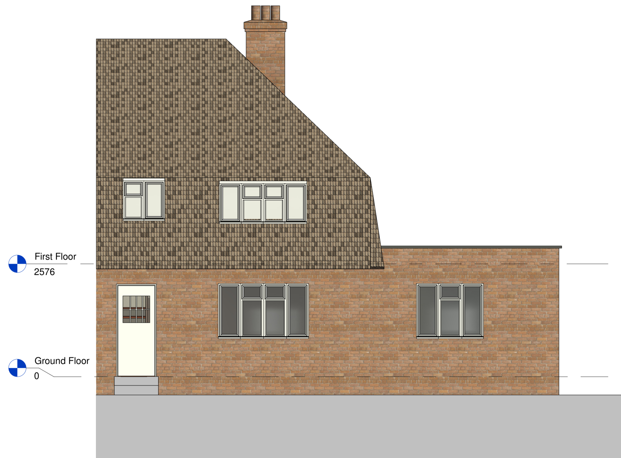
Front Elevation 1 : 50