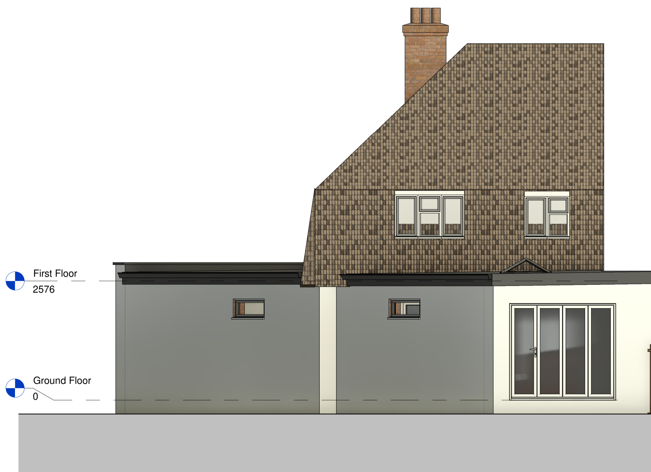
Rear Elevation 1 : 50