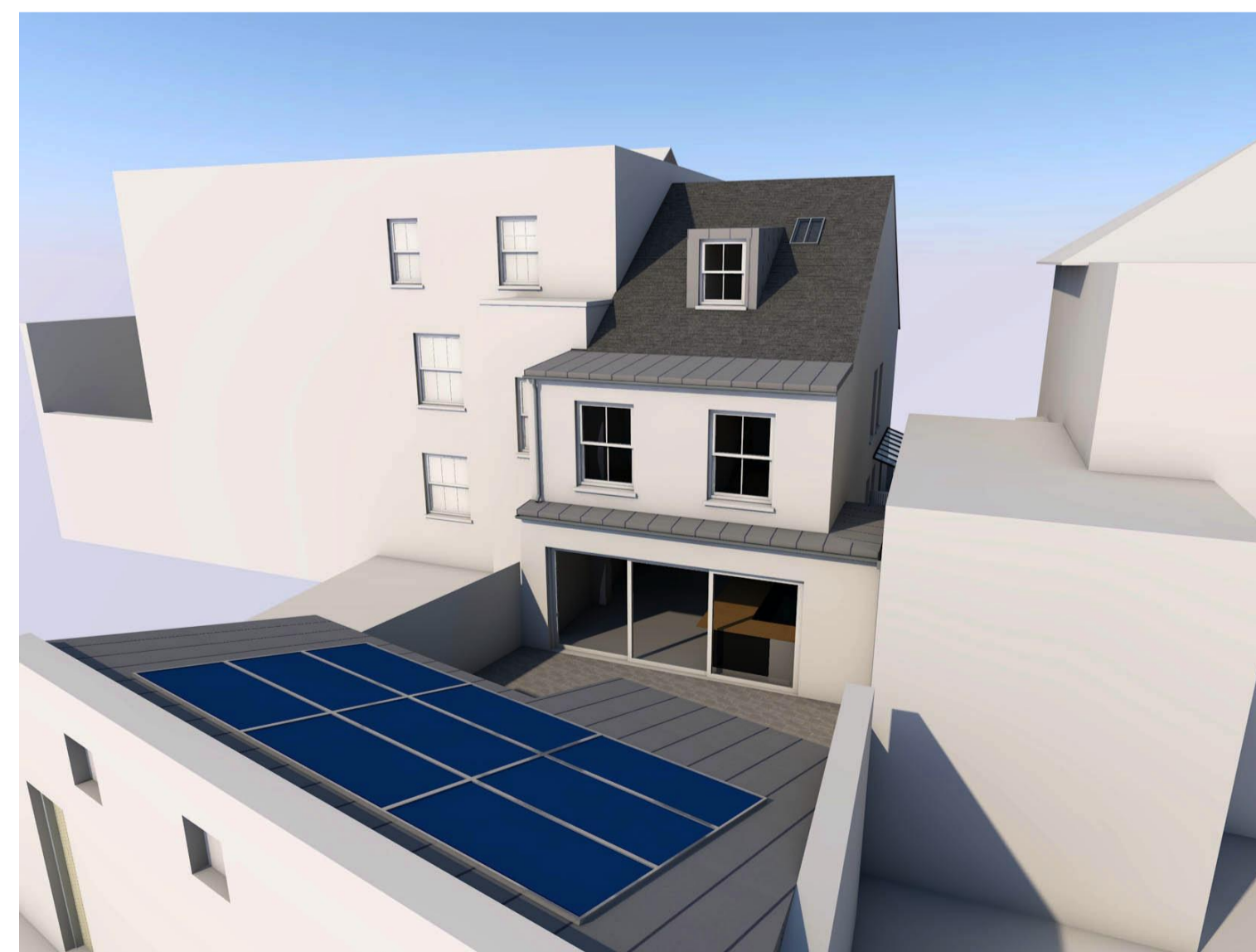
5 Proposed North Elevation