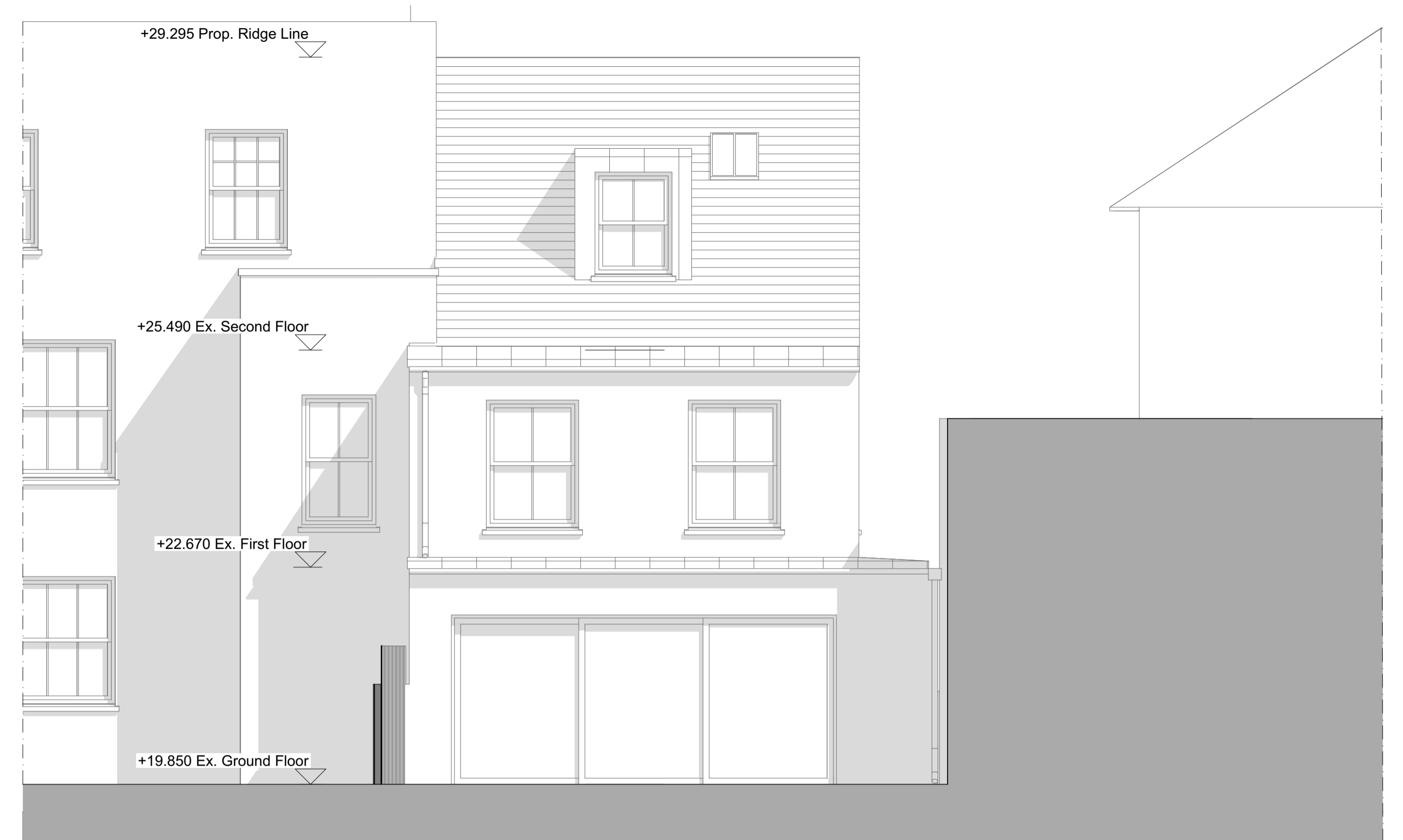
3 Proposed North Elevation (Rear)