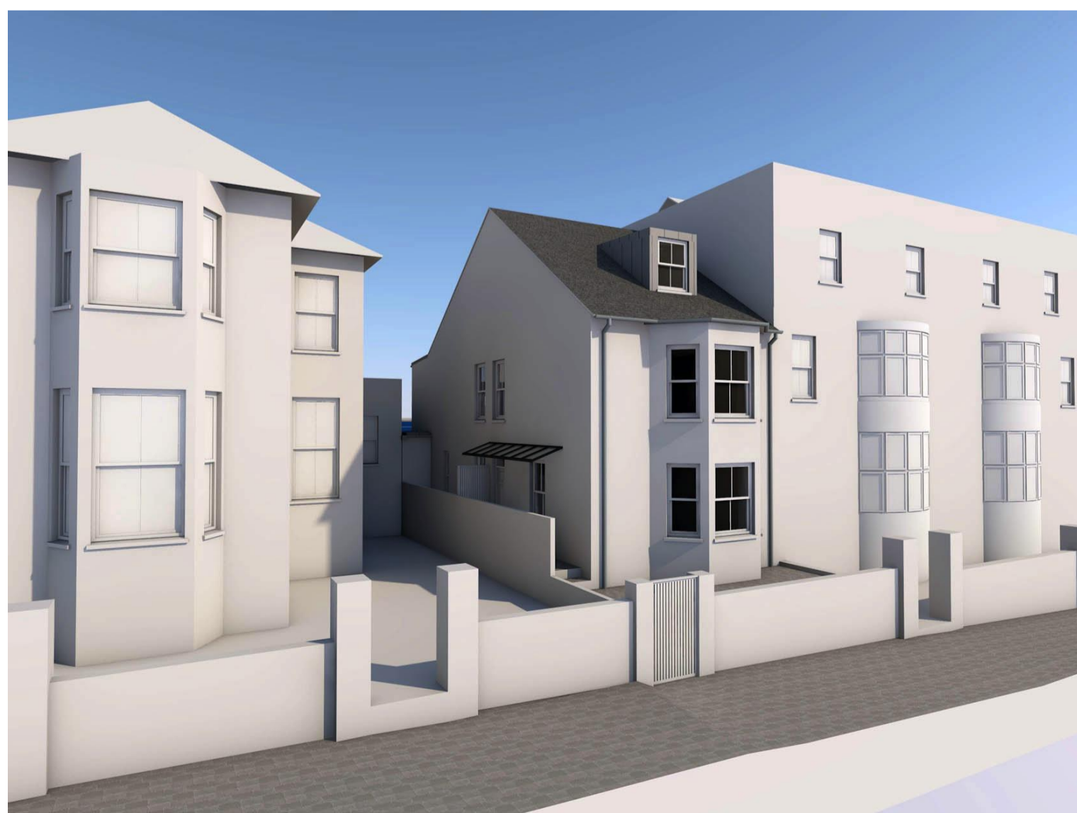
4 Proposed South Elevation