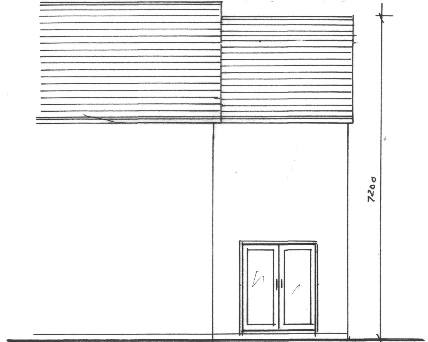
PROPOSED SIDE ELEVATION 1:50