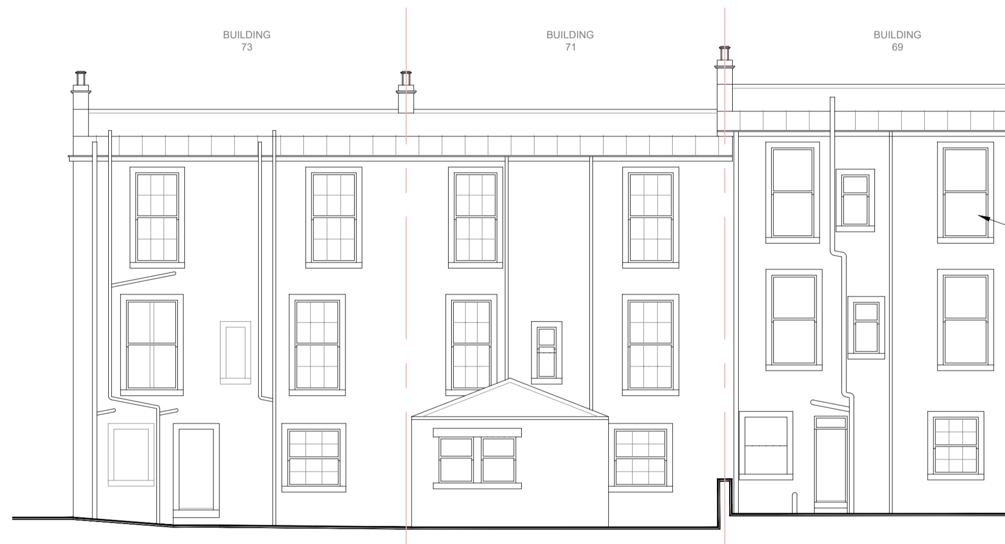
PROPOSED EAST ELEVATION Scale 1:100