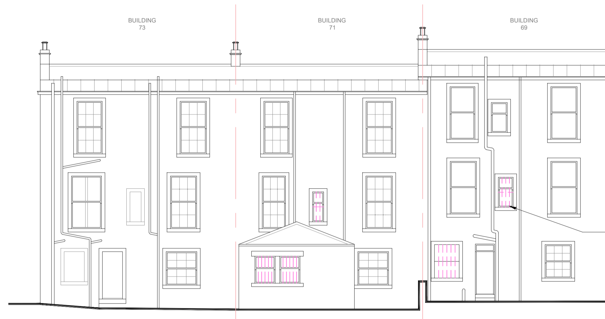
EXISTING EAST ELEVATION Scale 1:100