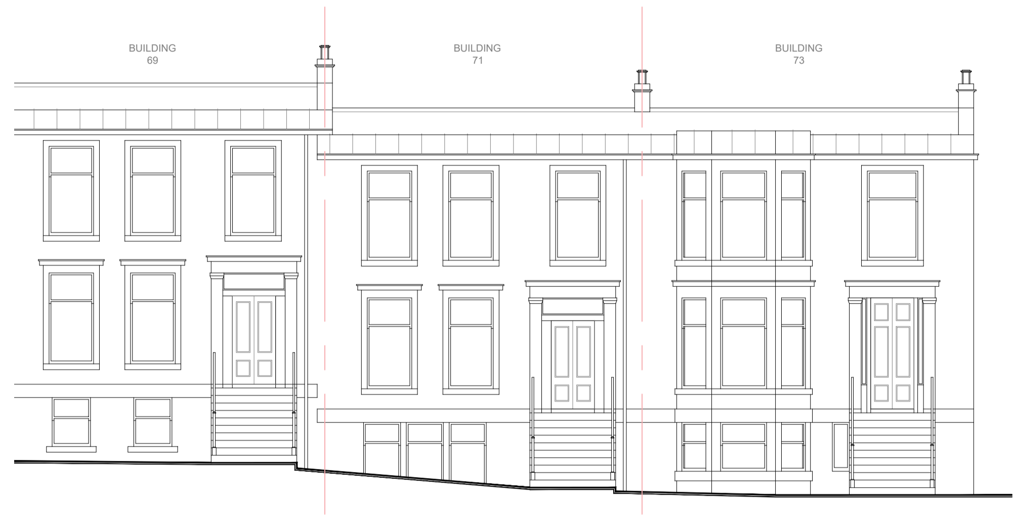
EXISTING WEST ELEVATION Scale 1:100