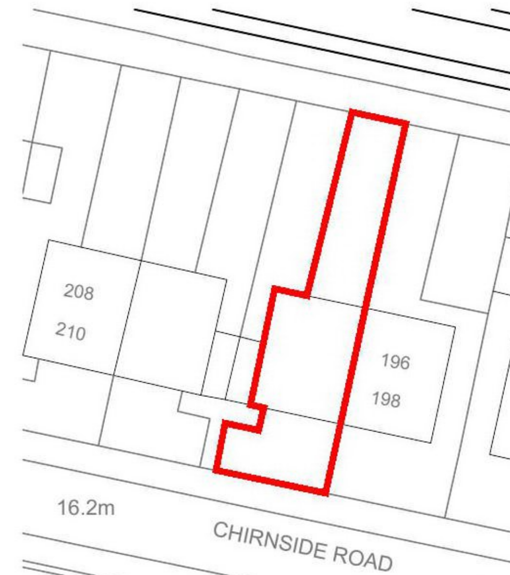
Existing Site Block Plan 1:500