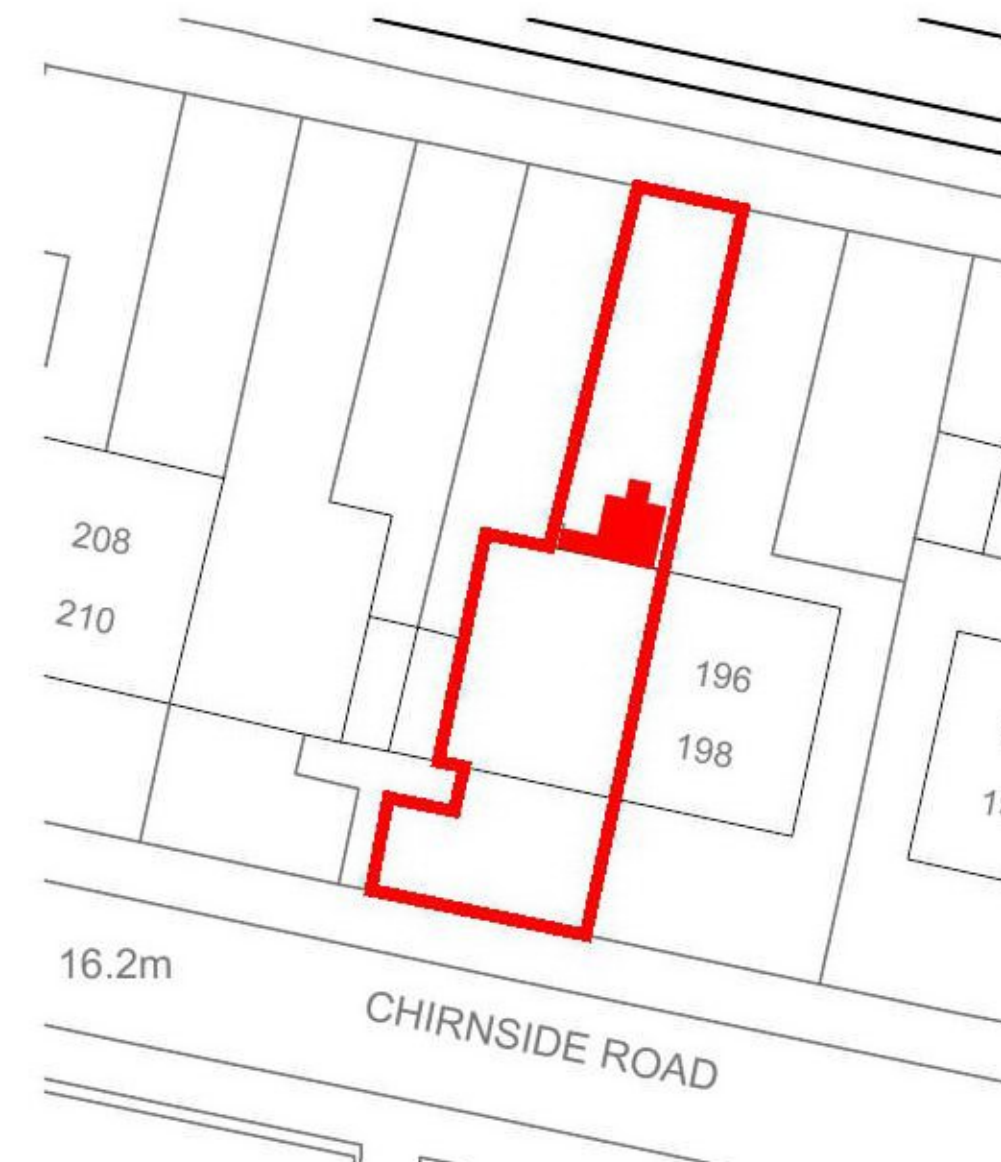
Proposed Site Block Plan 1:500