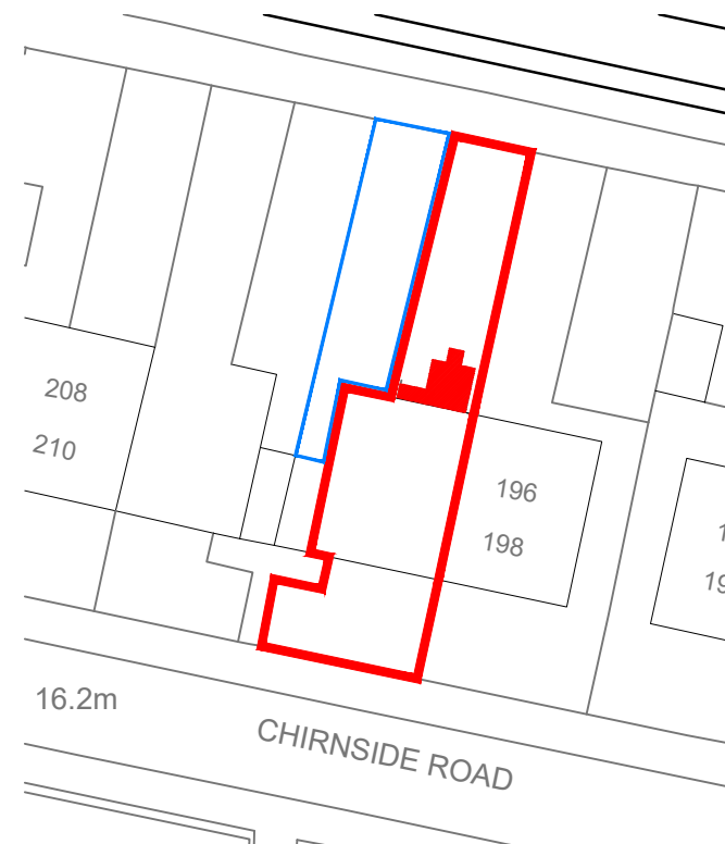
Proposed Site Block Plan 1:500