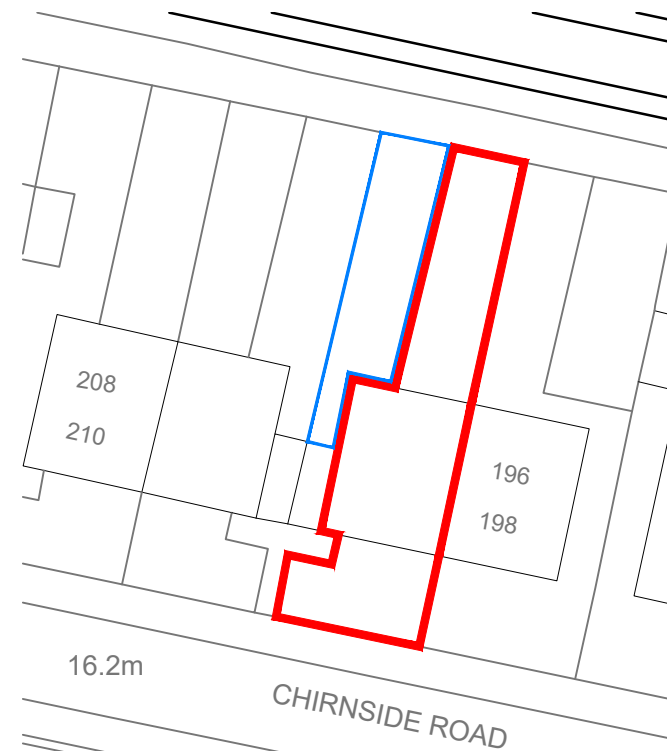
Existing Site Block Plan 1:500