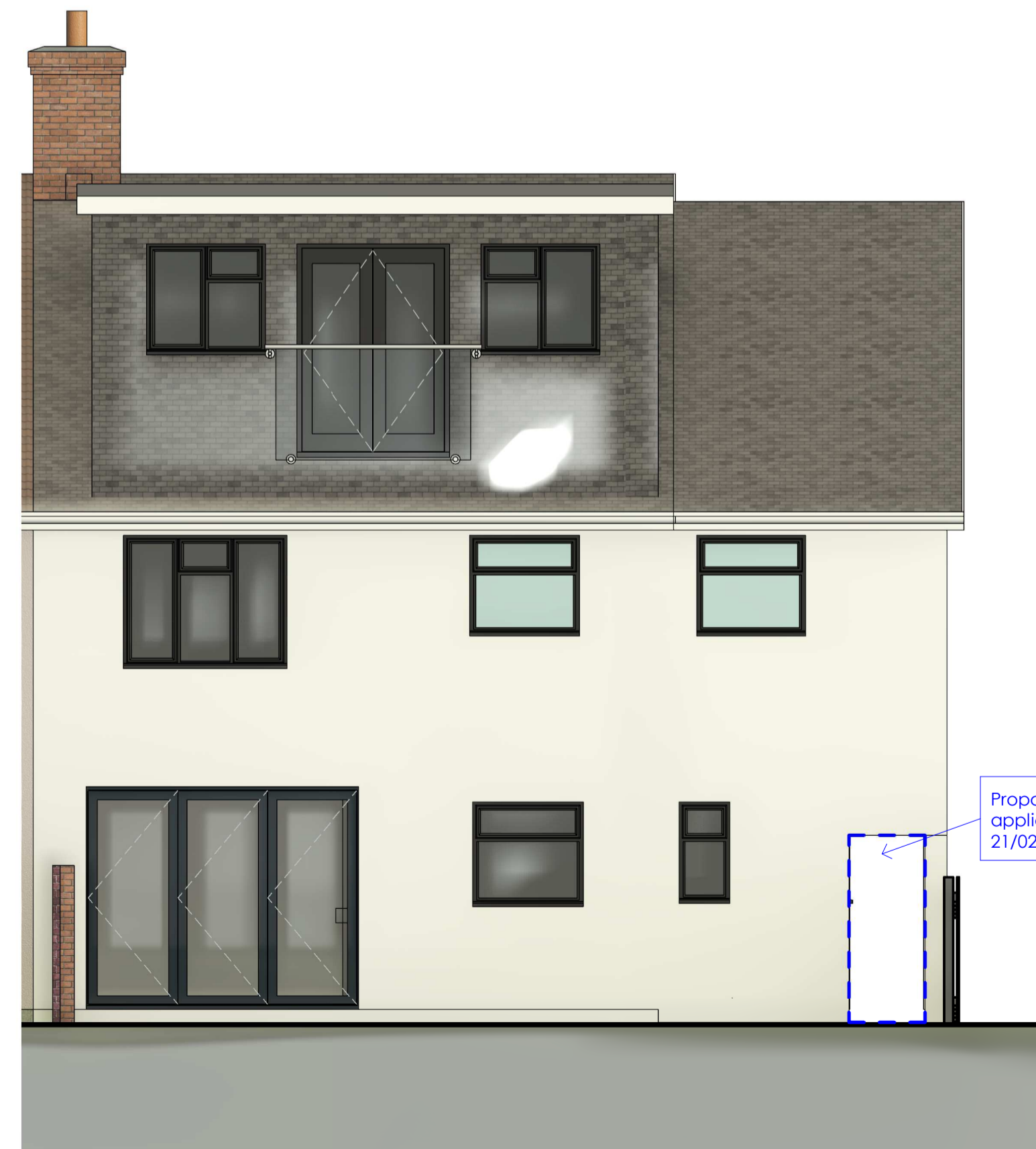
Proposed Rear Elevation 1 : 50