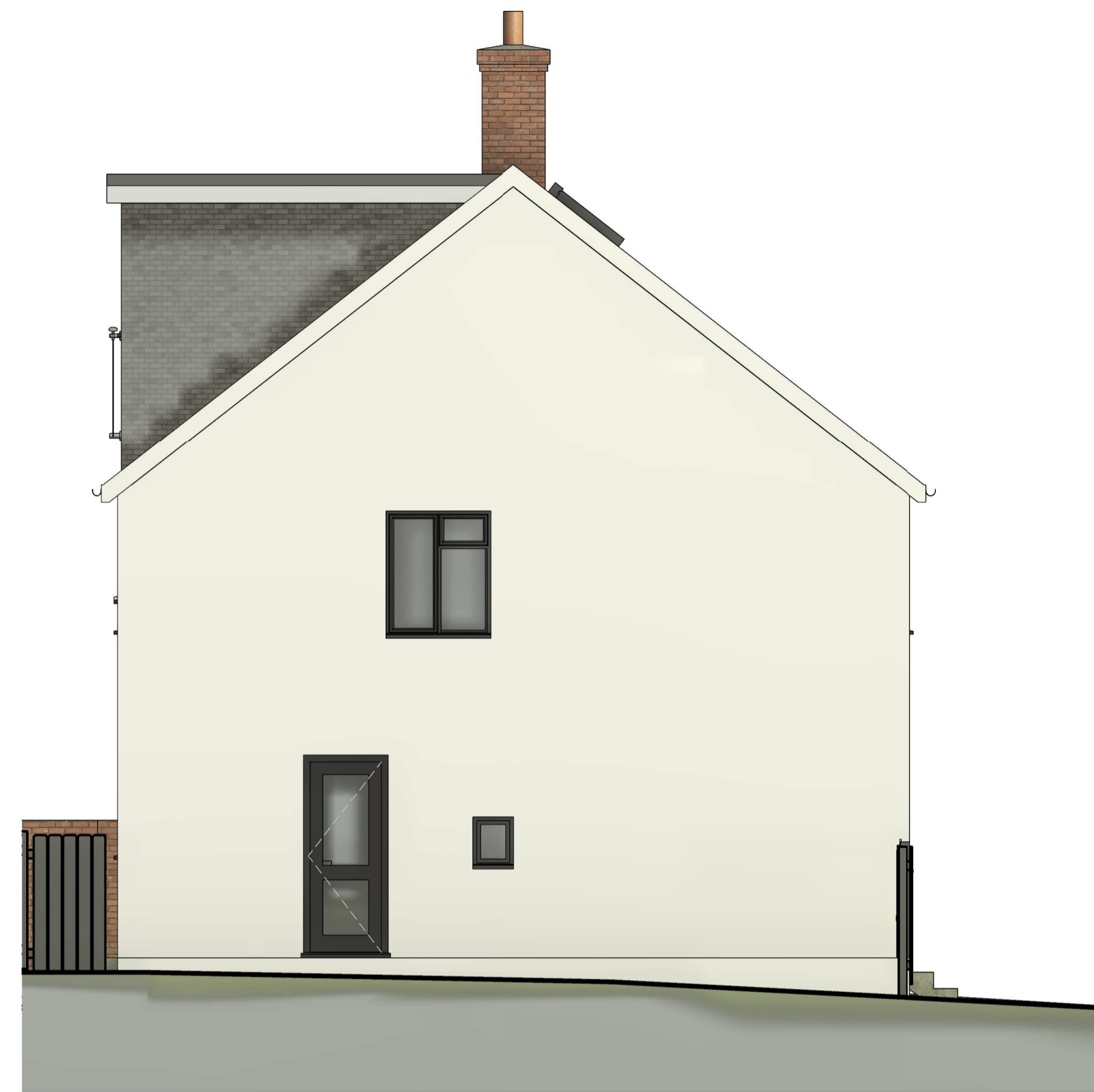
Proposed Side Elevation (1) 1 : 50