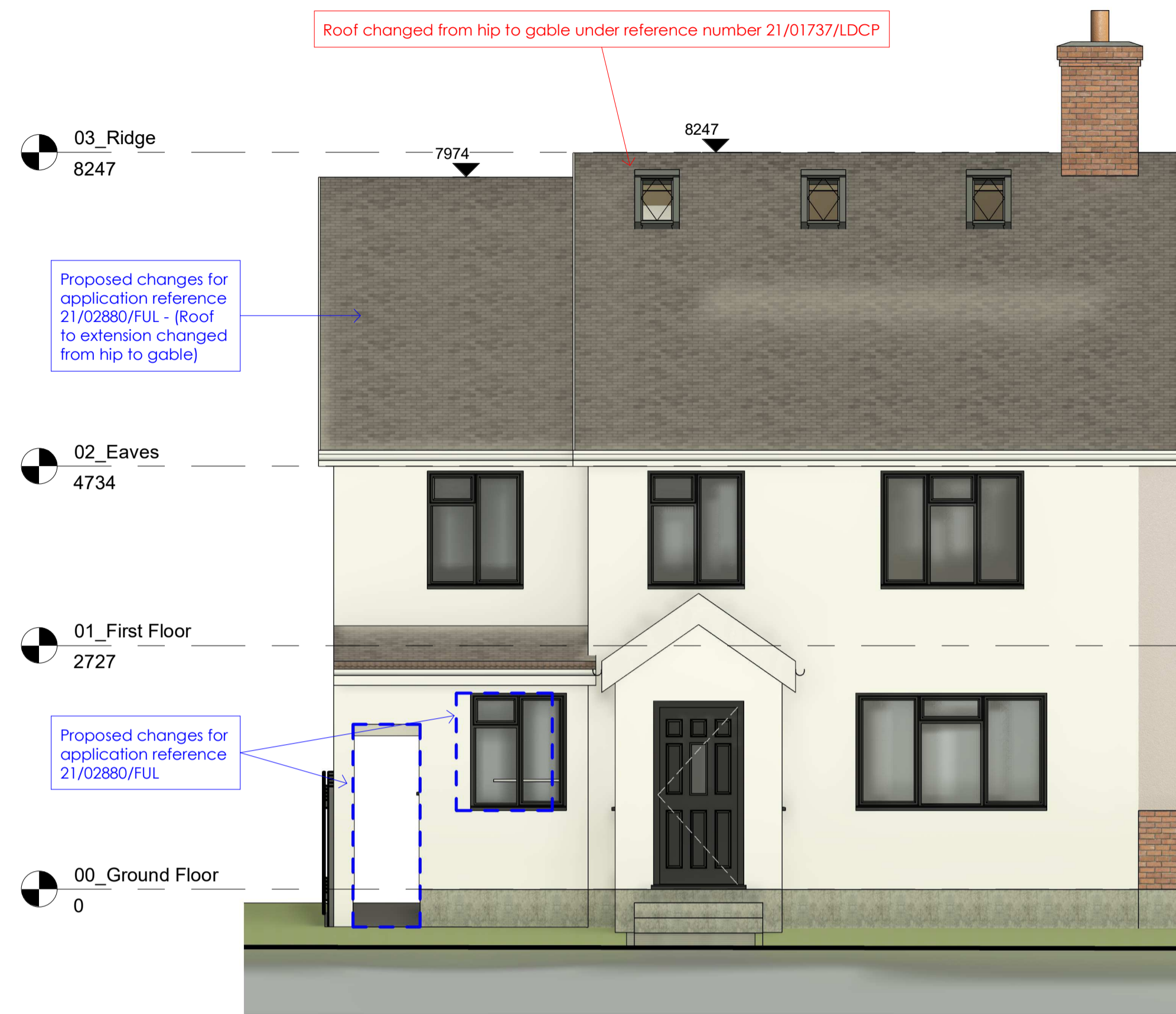
Proposed Front Elevation 1 : 50

NOTE: DORMER TOTAL VOLUME : 29.76 Cubic Metres