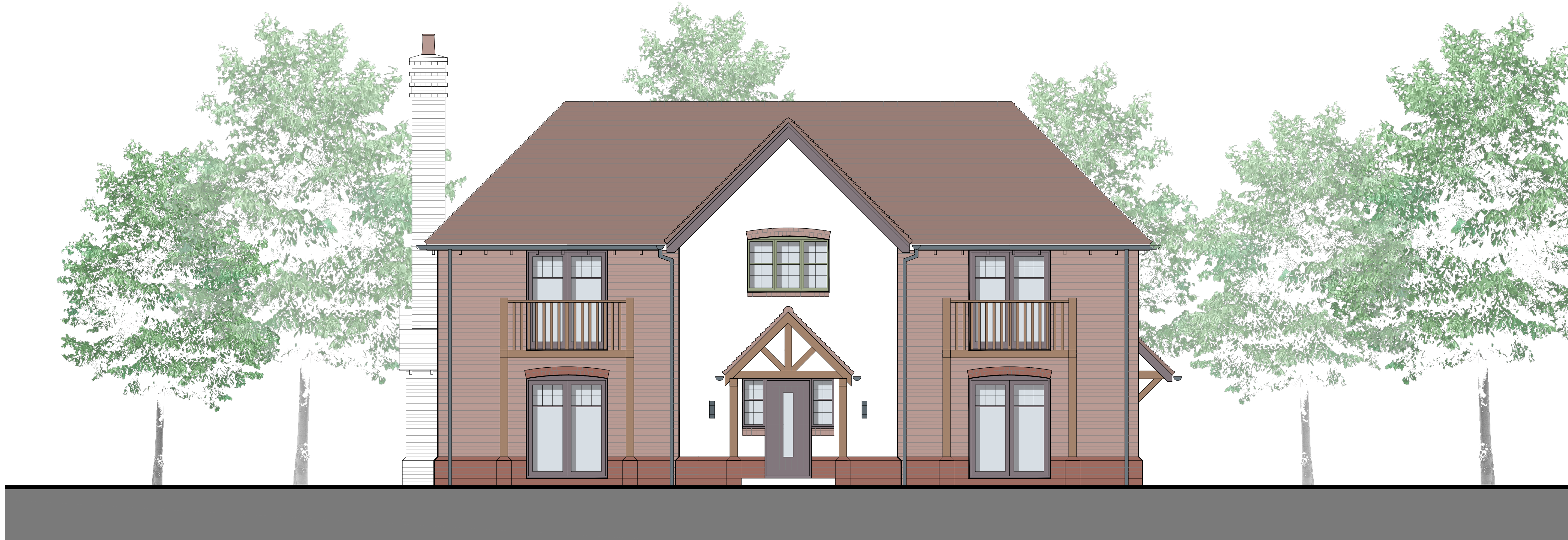
01 FRONT ELEVATION 1:50