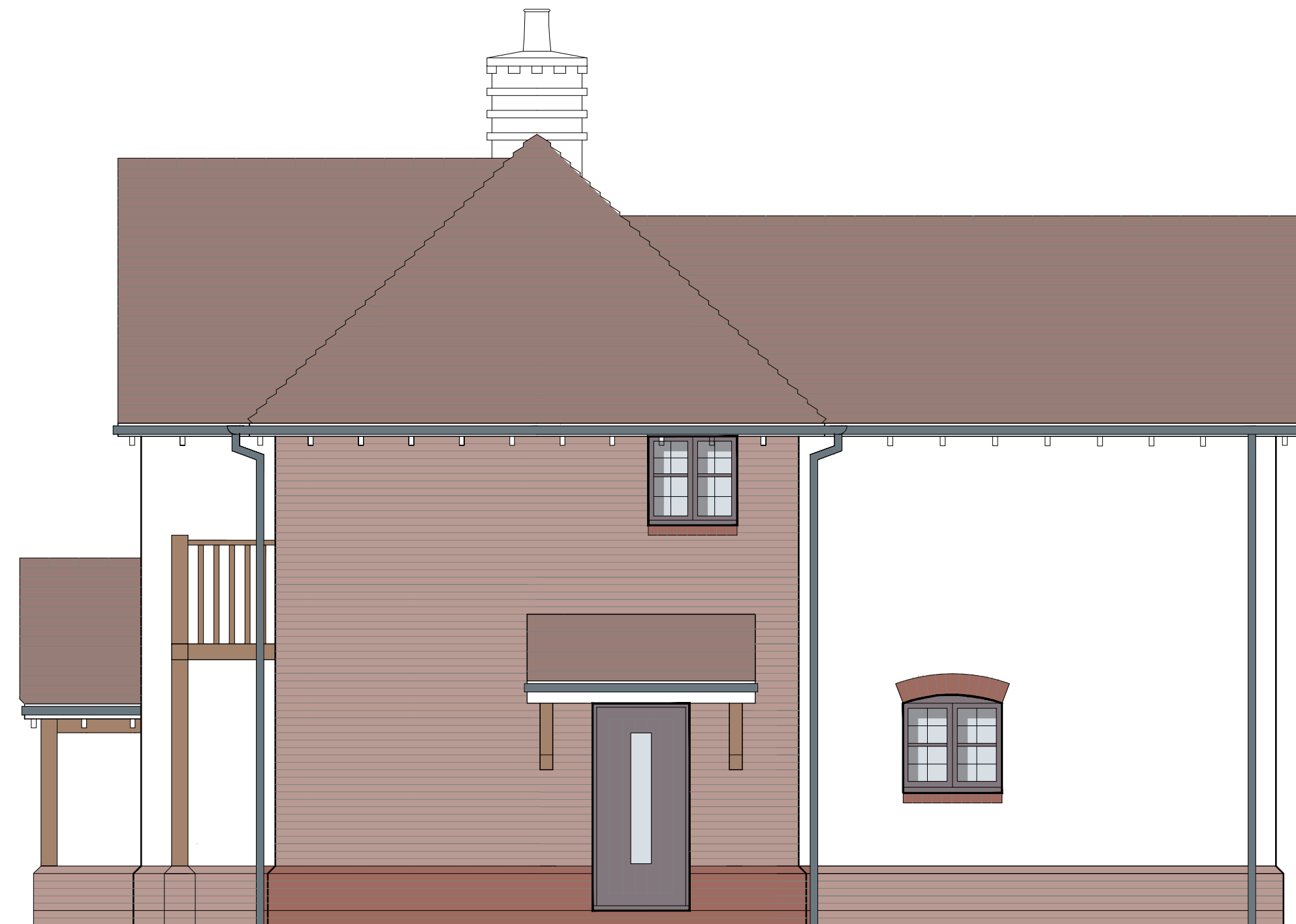
01 SIDE ELEVATION 1:50