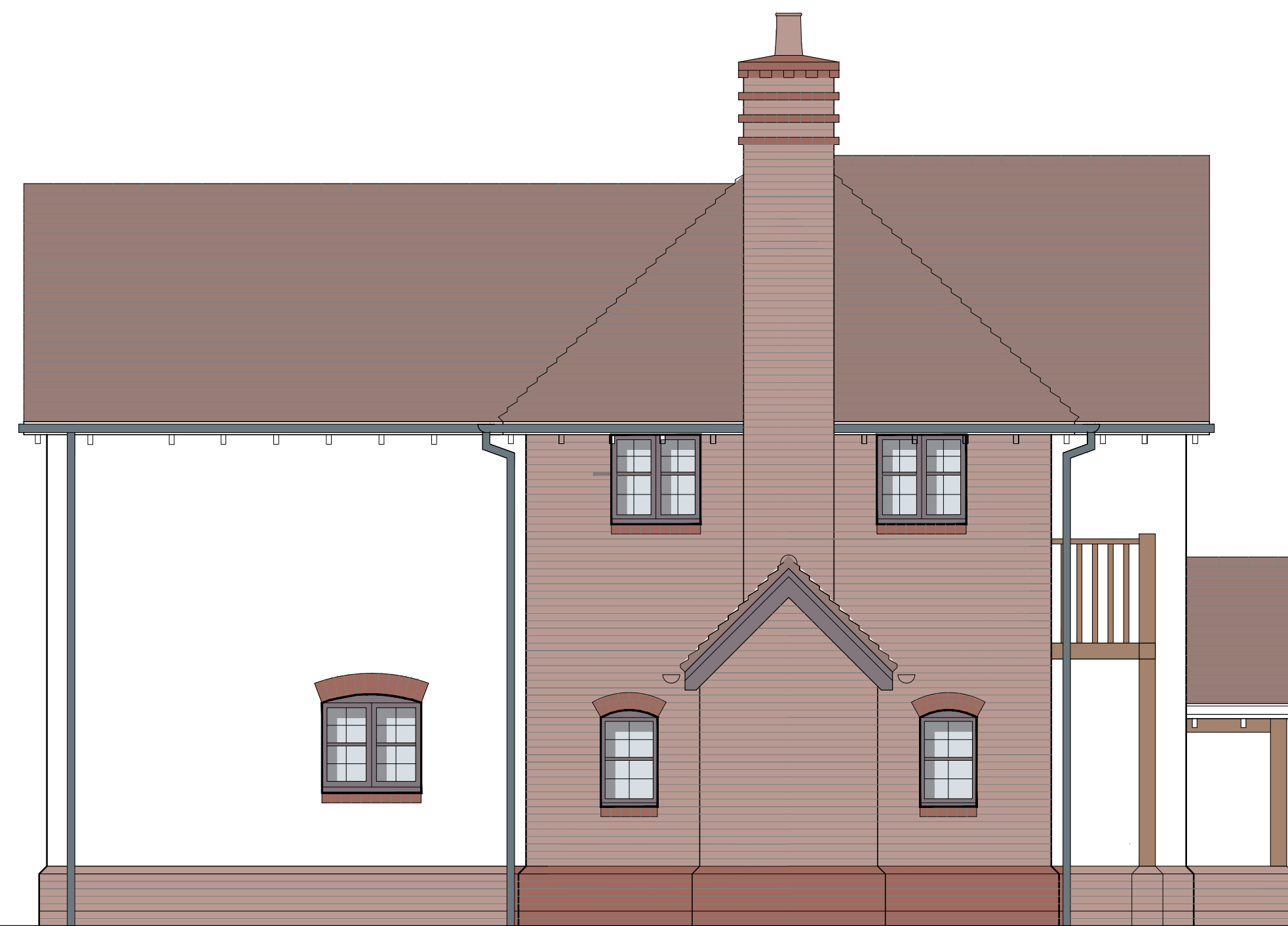
02 SIDE ELEVATION 1:50