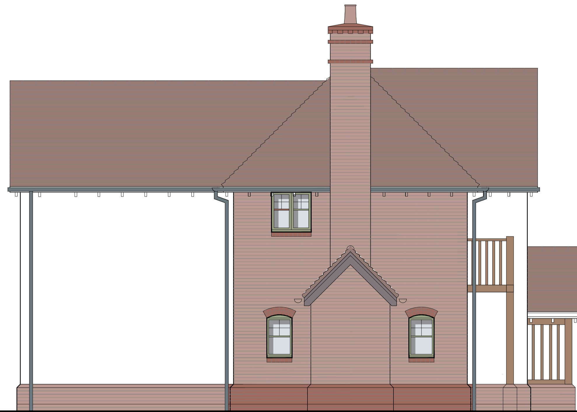
02 SIDE ELEVATION 1:50