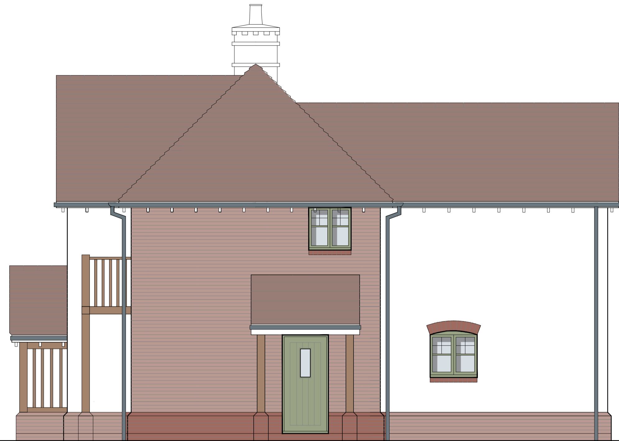
01 SIDE ELEVATION 1:50