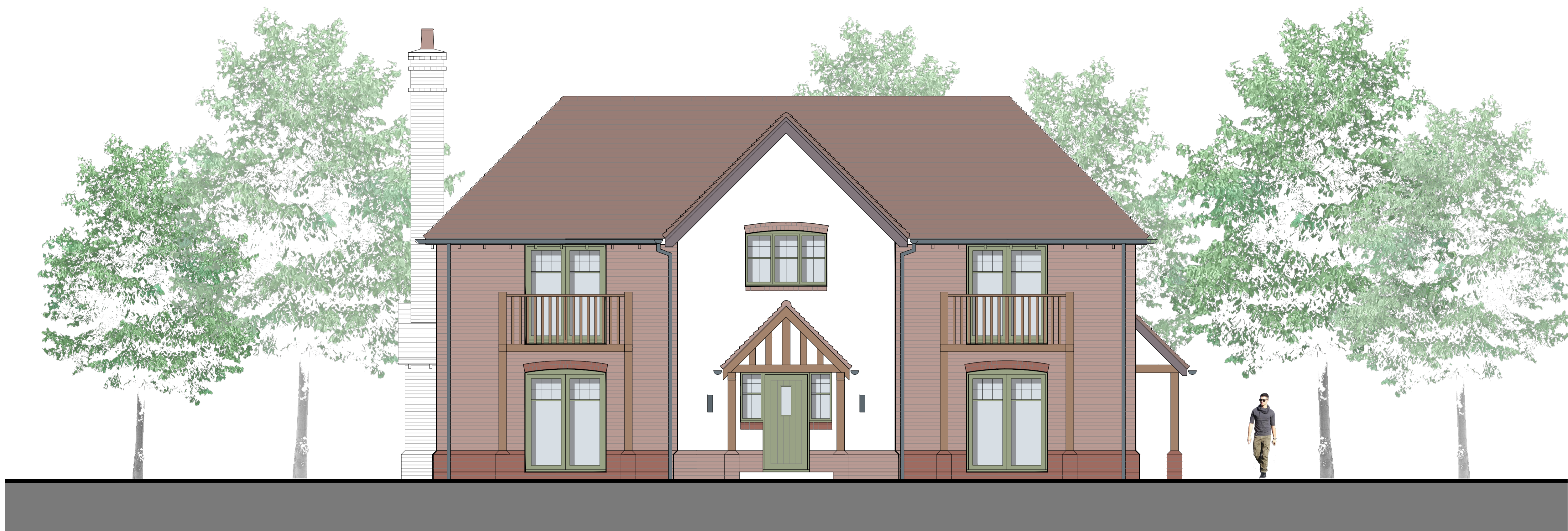
01 FRONT ELEVATION 1:50