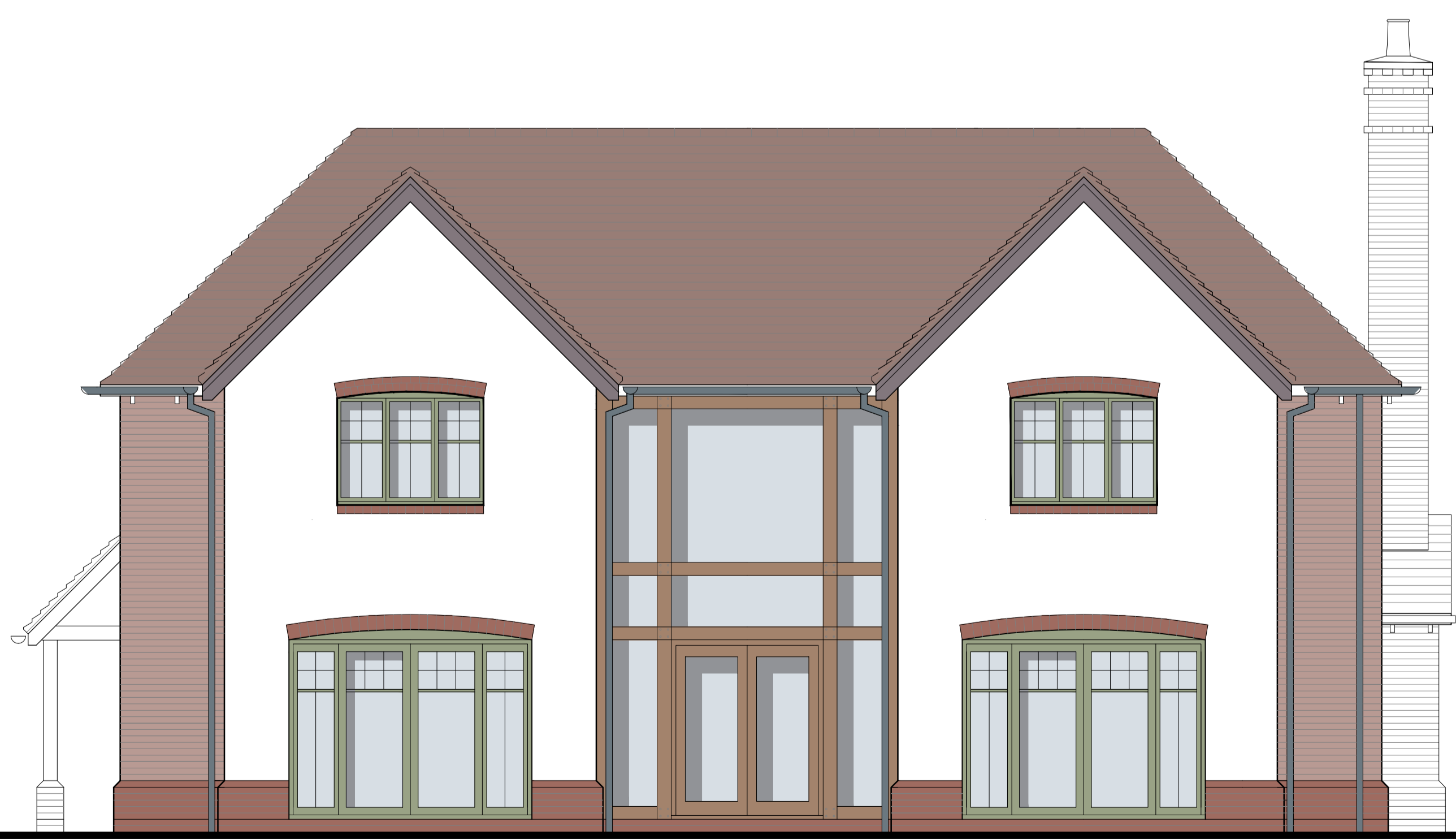
02 REAR ELEVATION 1:50