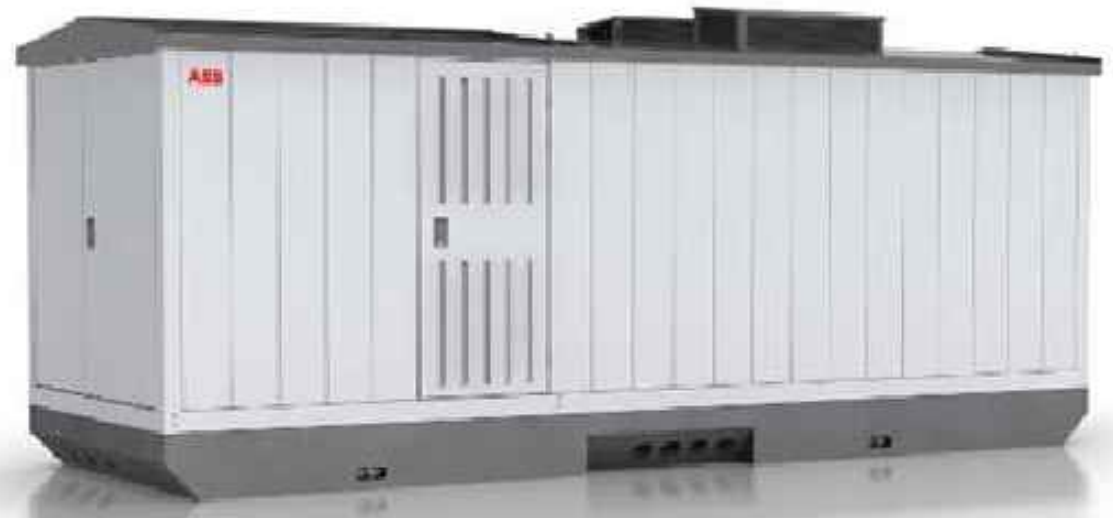
TYPICAL INVERTOR SUBSTATION ALL SUBJECT TO FINAL DESIGN