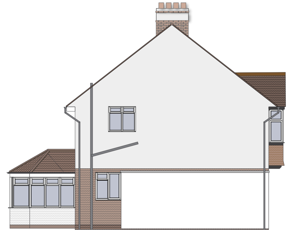
Scale 1 : 100 Existing (South facing) side elevation 66