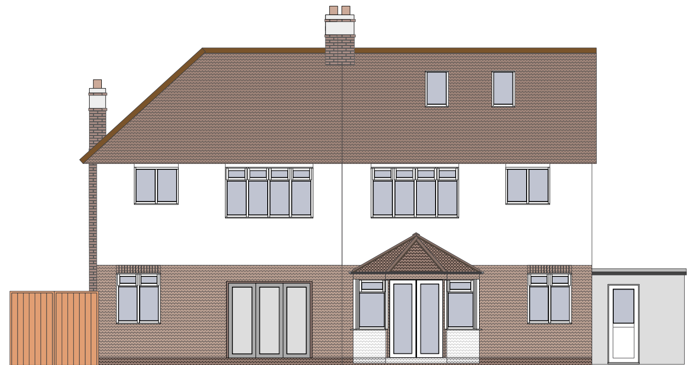
Scale 1 : 100 Existing (West facing) rear elevation 64 & 66