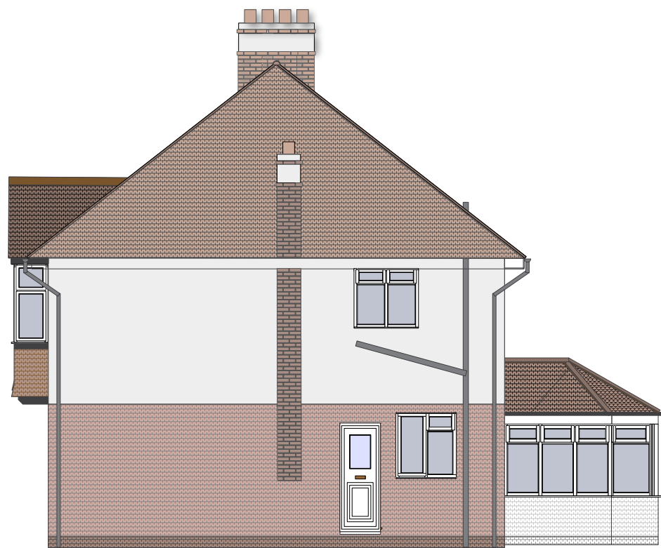
Scale 1 : 100 Existing (North facing) side elevation 64