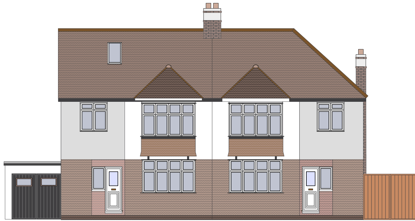
Scale 1 : 100 Existing (East facing) front elevation 66 & 64