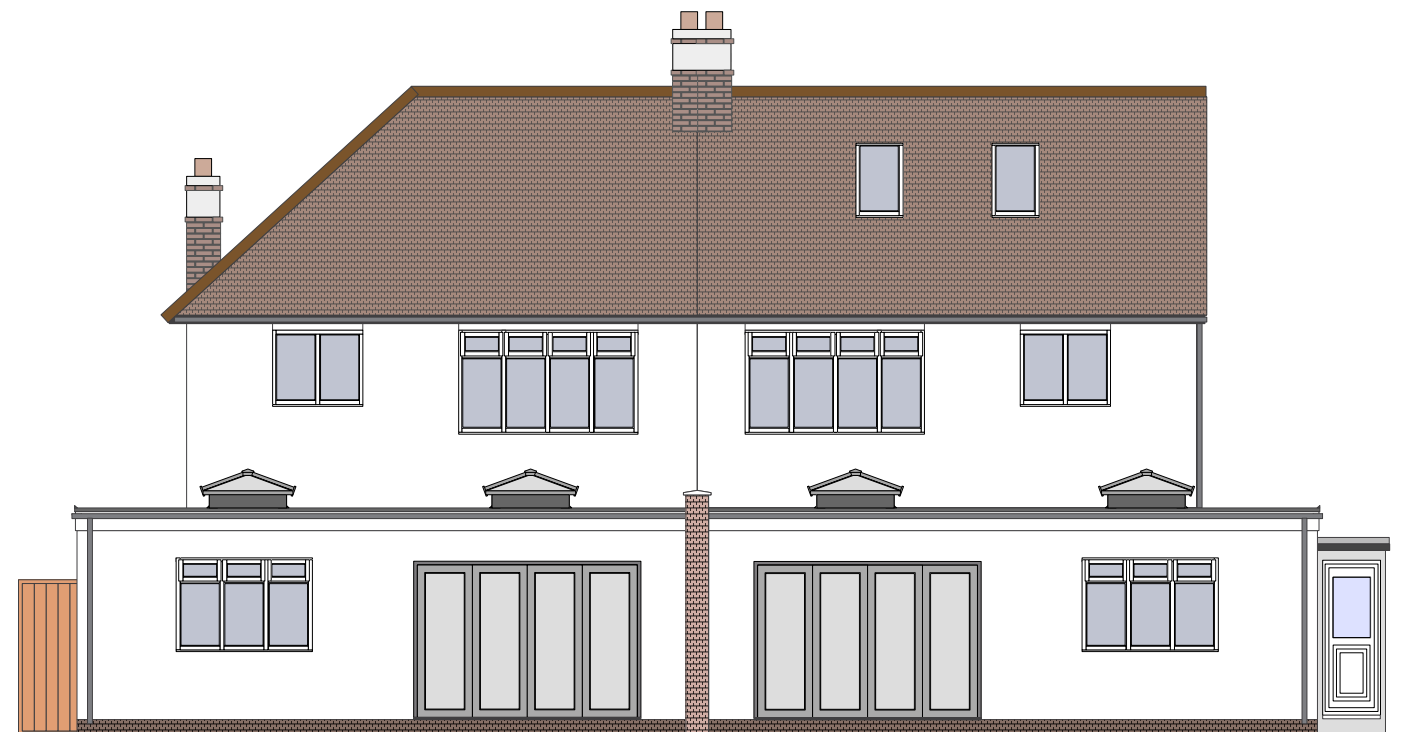
Scale 1 : 100 Proposed (West facing) rear elevation 64 & 66