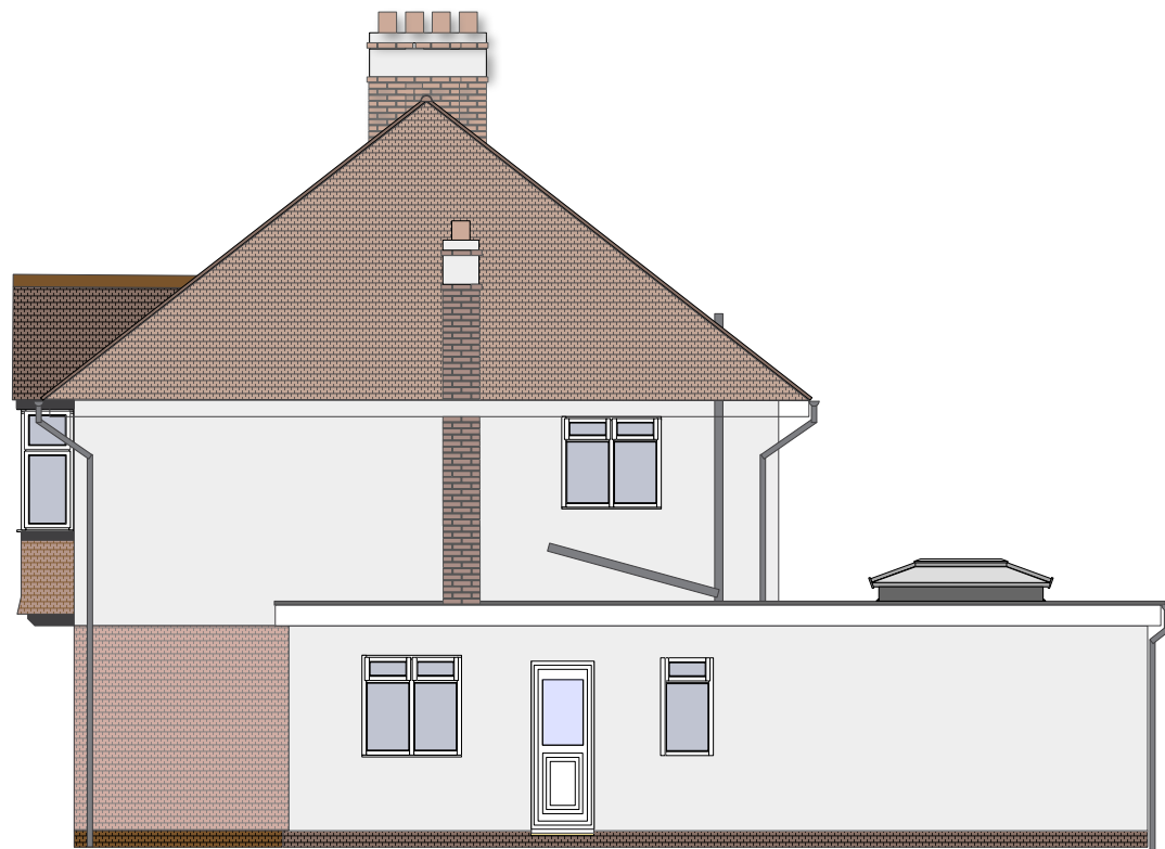
Scale 1 : 100 Proposed (North facing) side elevation 64

Rendered & painted White to match existing White Upvc windows & rear door Bi-fold doors Grey