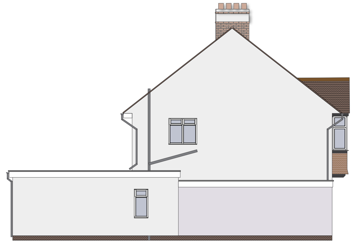
Scale 1 : 100 Proposed (South facing) side elevation 66