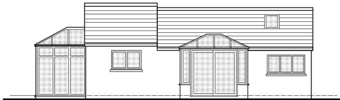
SOUTH - WEST ELEVATION