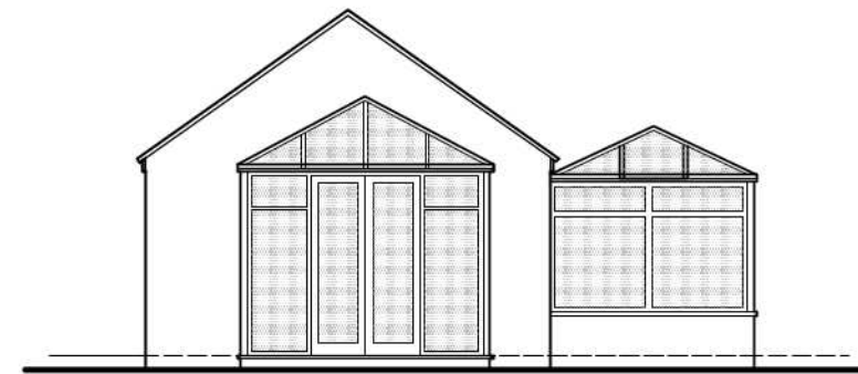
NORTH - WEST ELEVATION