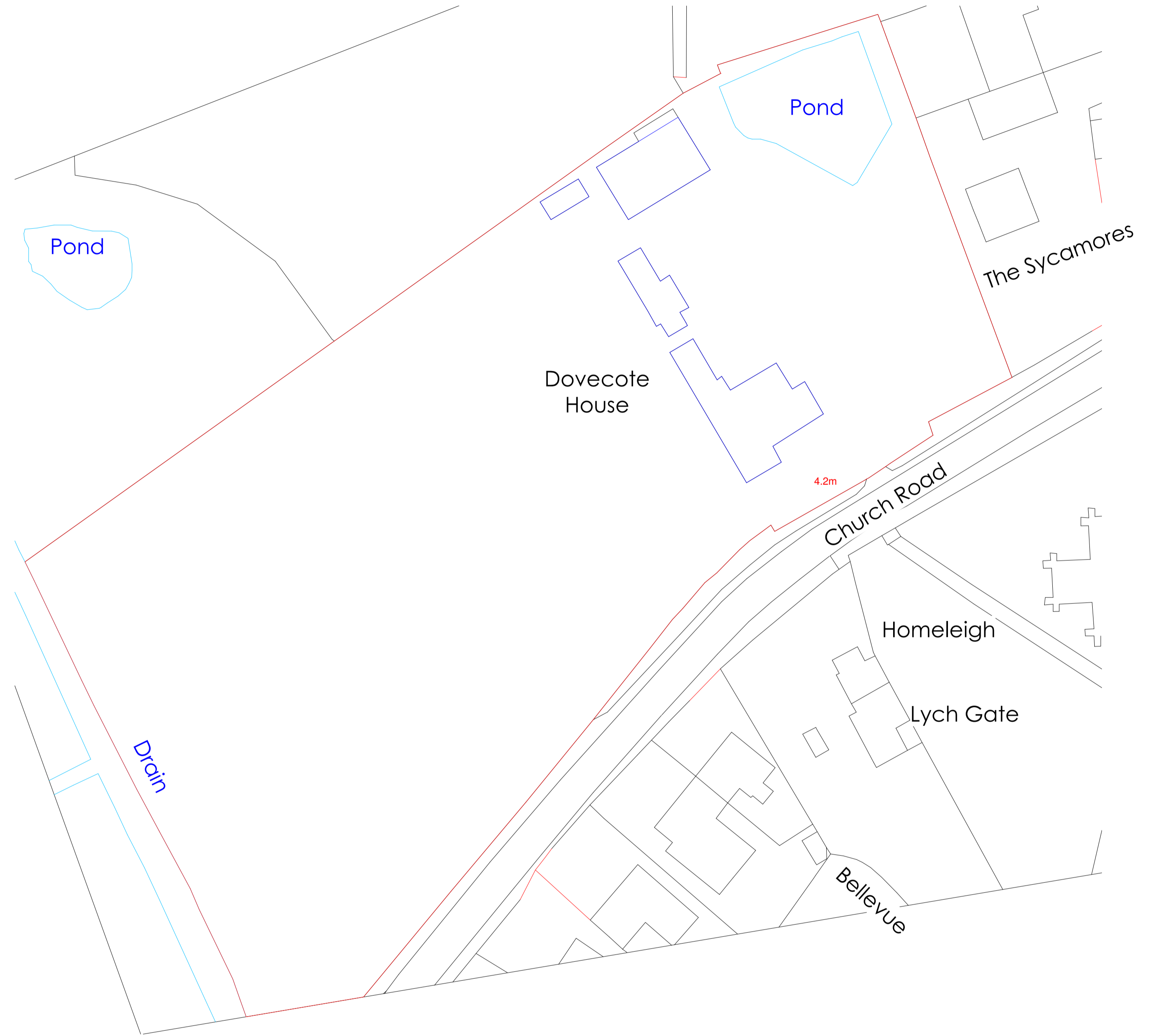
3 Site Plan Pr 1 : 500