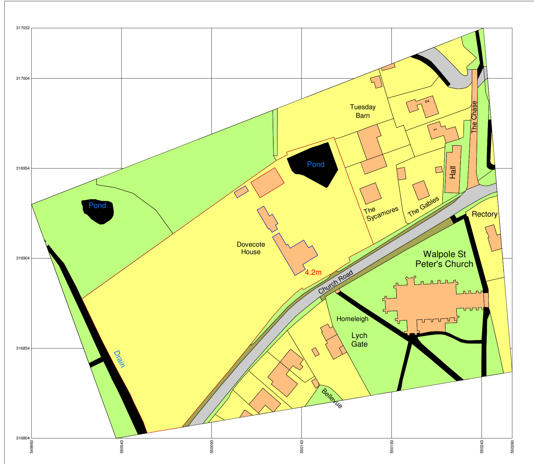
1 Location Plan Ex 1 : 1250

Produced on 22 December 2021 from the Ordnance Survey National Geographic Database and incorporating surveyed revision available at this date. This map shows the area bounded by 550042 316804 550200 316841 550244 317022 549993 316834 550040 316804 Reproduction in whole or part is prohibited without the prior permission of Ordnance Survey. Crown copyright 2021. Supplied by copyright trading as UKPlanningMaps.com a licensed Ordnance Survey partner (100054135). Data licence expires 23 December 2022. Unique plan reference: w/171430/988214