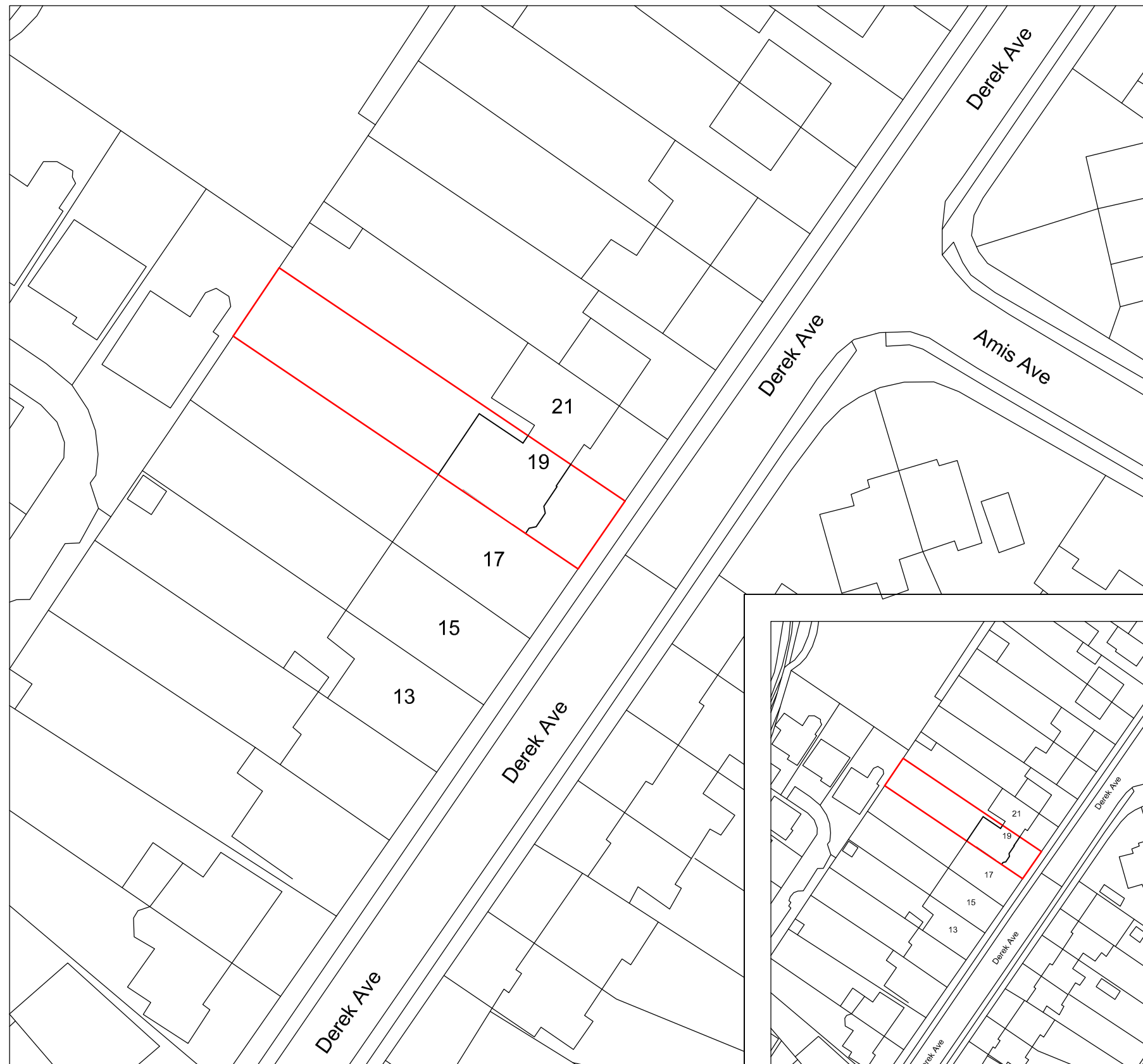
SITE BLOCK PLAN SCALE 1:500