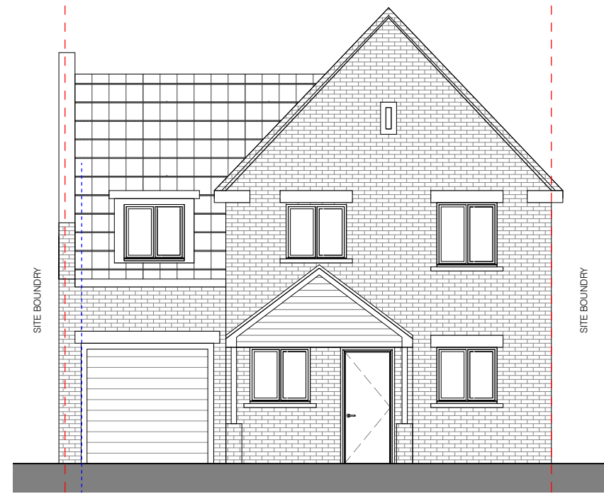
2 Elevation 2 - Proposed Scale: 1 : 100