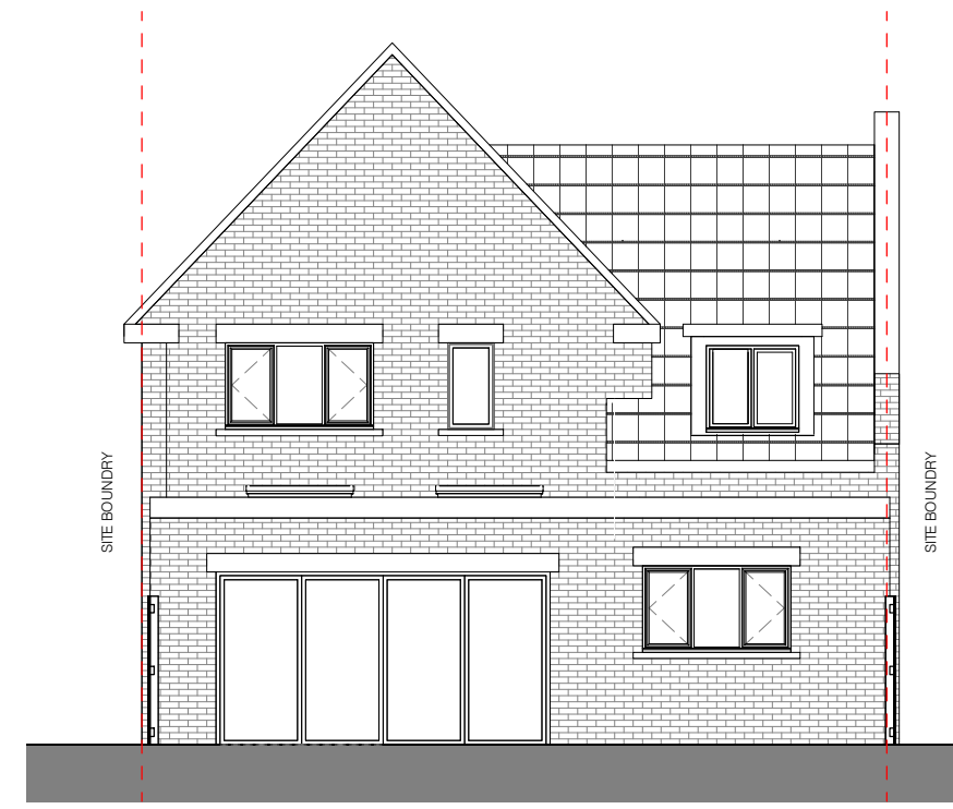
4 Elevation 4 - Proposed Scale: 1 : 100