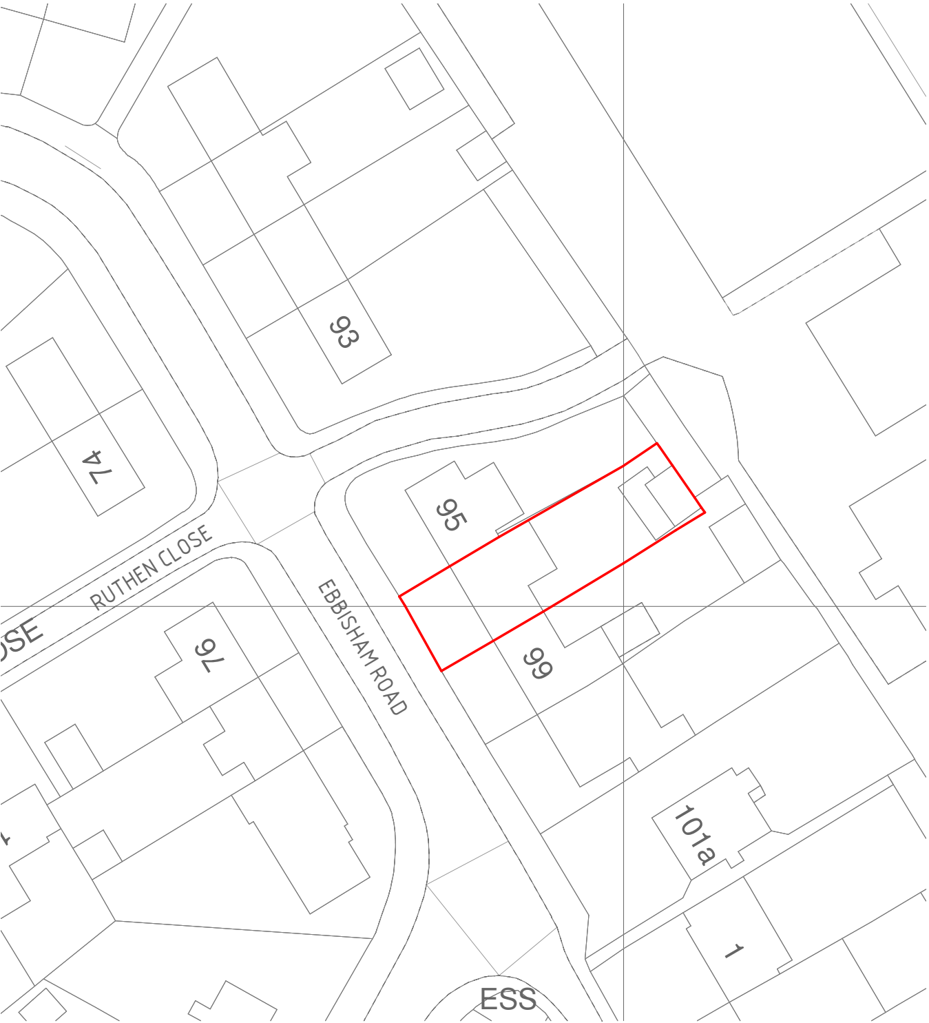
02/EBP - EXISTING BLOCK PLAN 1: 500

NOTE: All measurements to be checked on site. This drawing is prepared for planning purposes only.