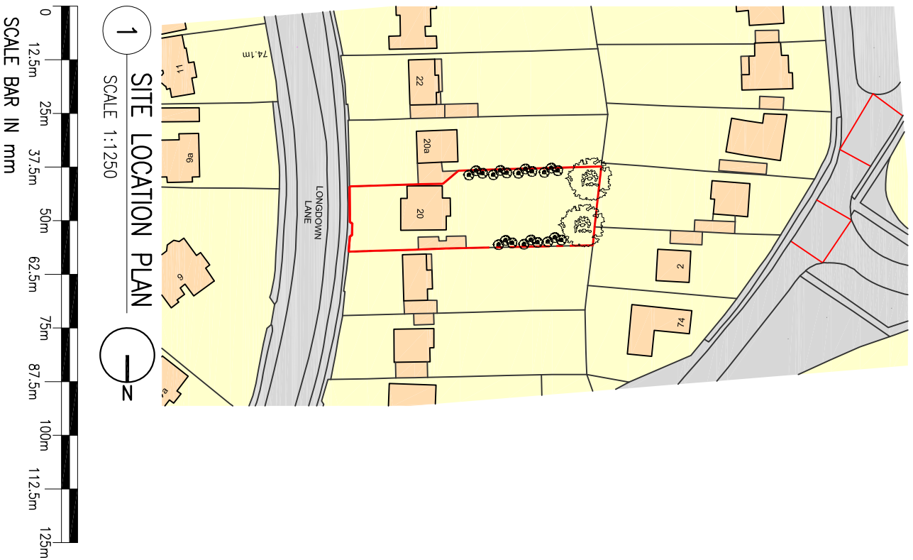
1 SITE LOCATION PLAN SCALE 1:1250