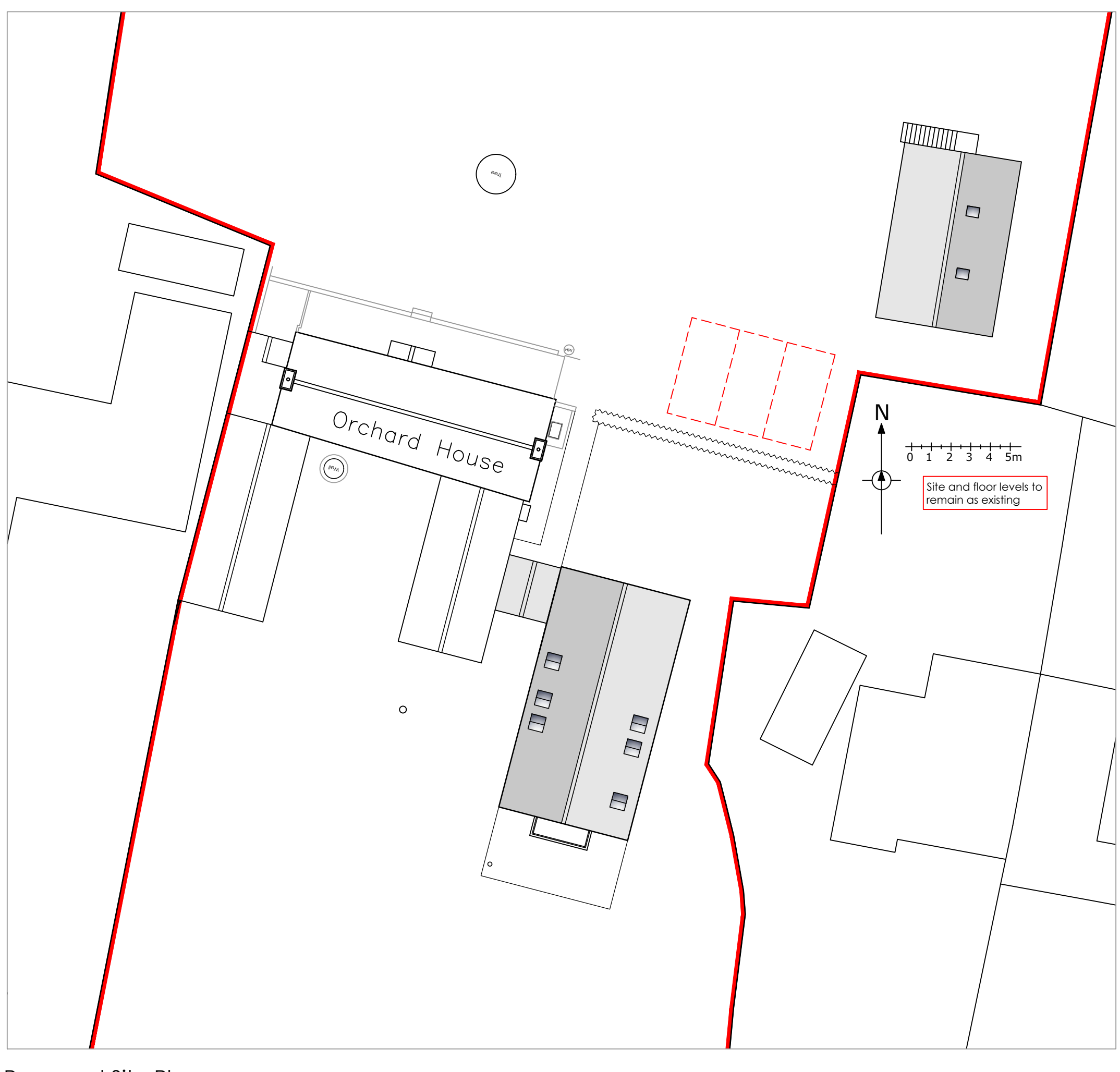
Proposed Site Plan 1:200