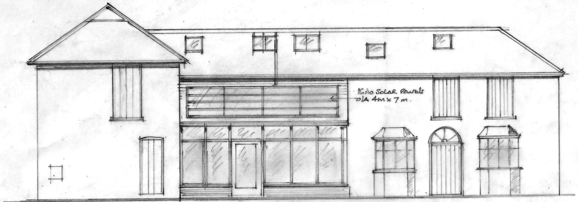
WEST ELEVATION. — AS PROPOSED.