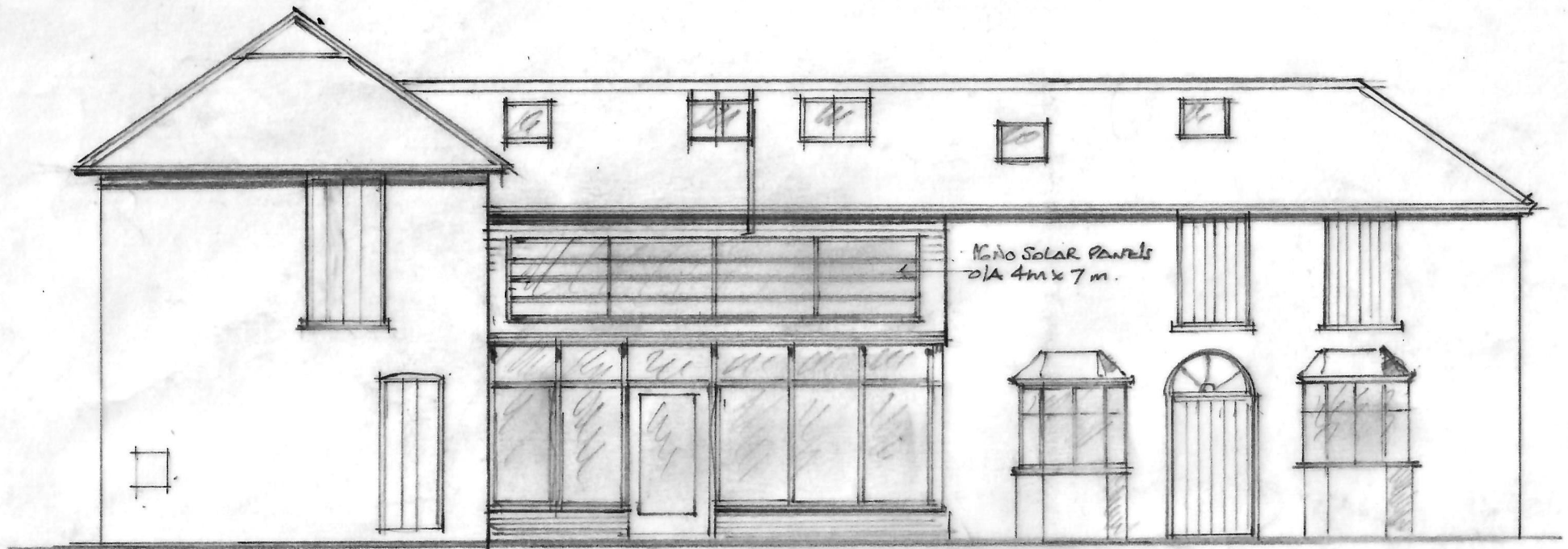
WEST ELEVATION. — AS PROPOSED.