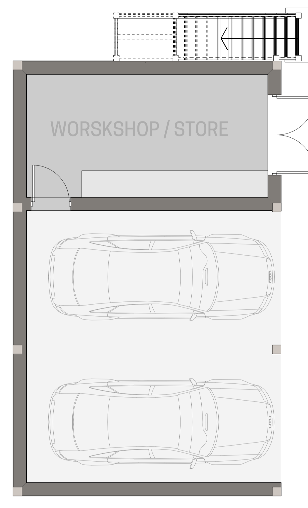
PROPOSED GROUND FLOOR GARAGE PLANS

KODA architects and historic building consultants