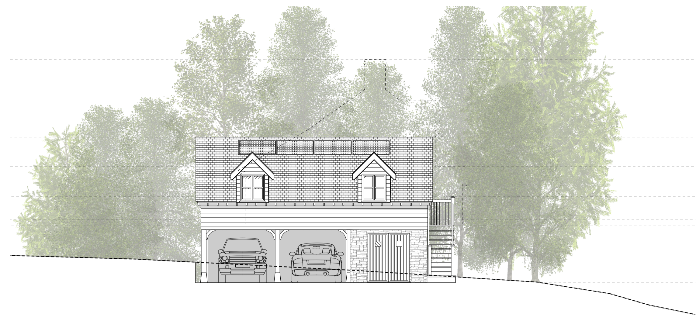
PROPOSED SIDE GARAGE ELEVATION