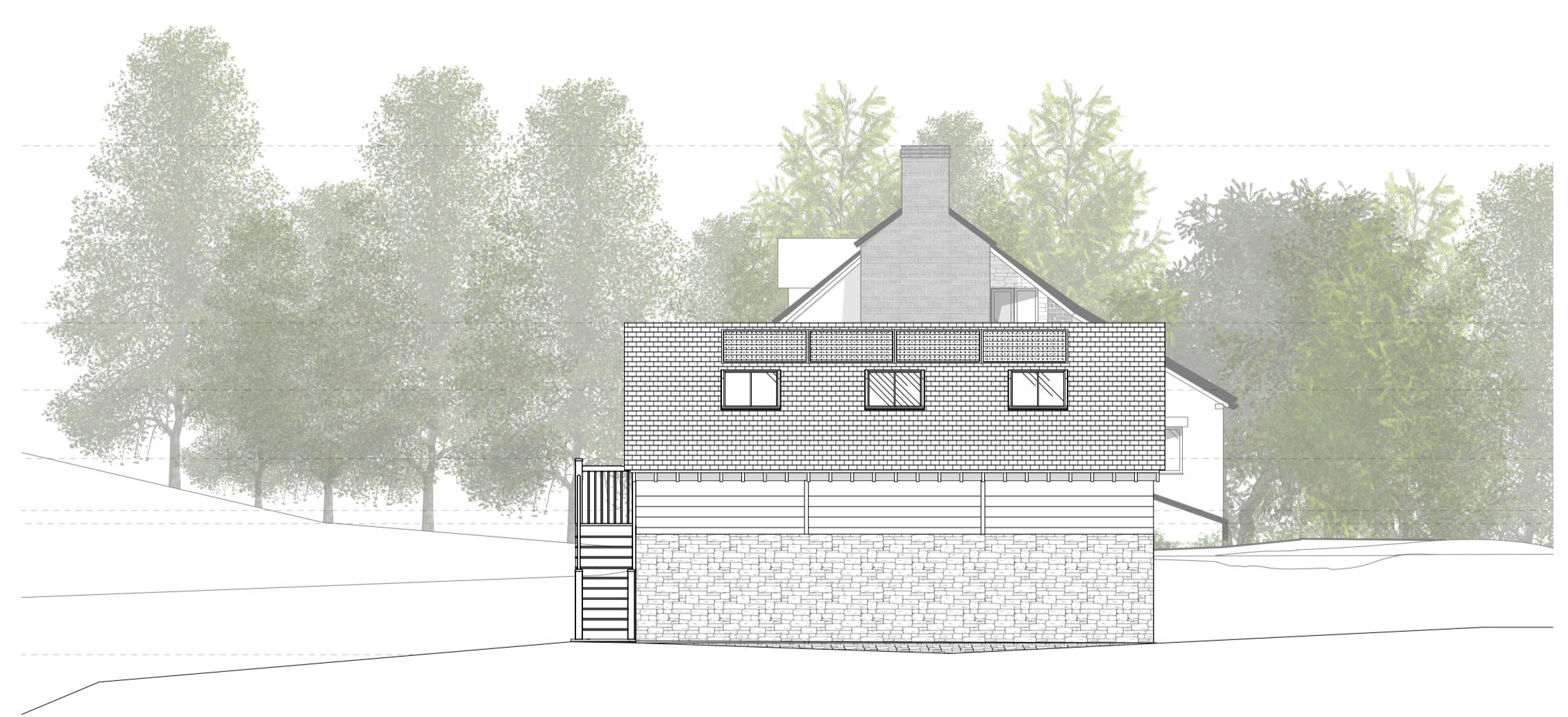
PROPOSED REAR GARAGE ELEVATION