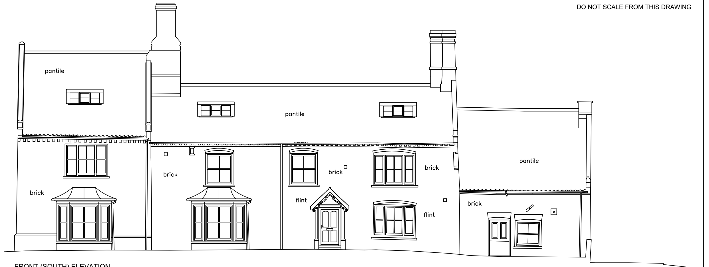
FRONT (SOUTH) ELEVATION