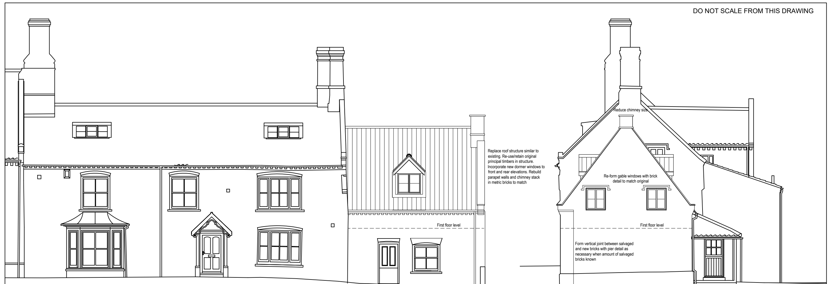
FRONT (SOUTH) ELEVATION

Rebuild front wall including forming door and window openings similar to existing using 3" bricks to match