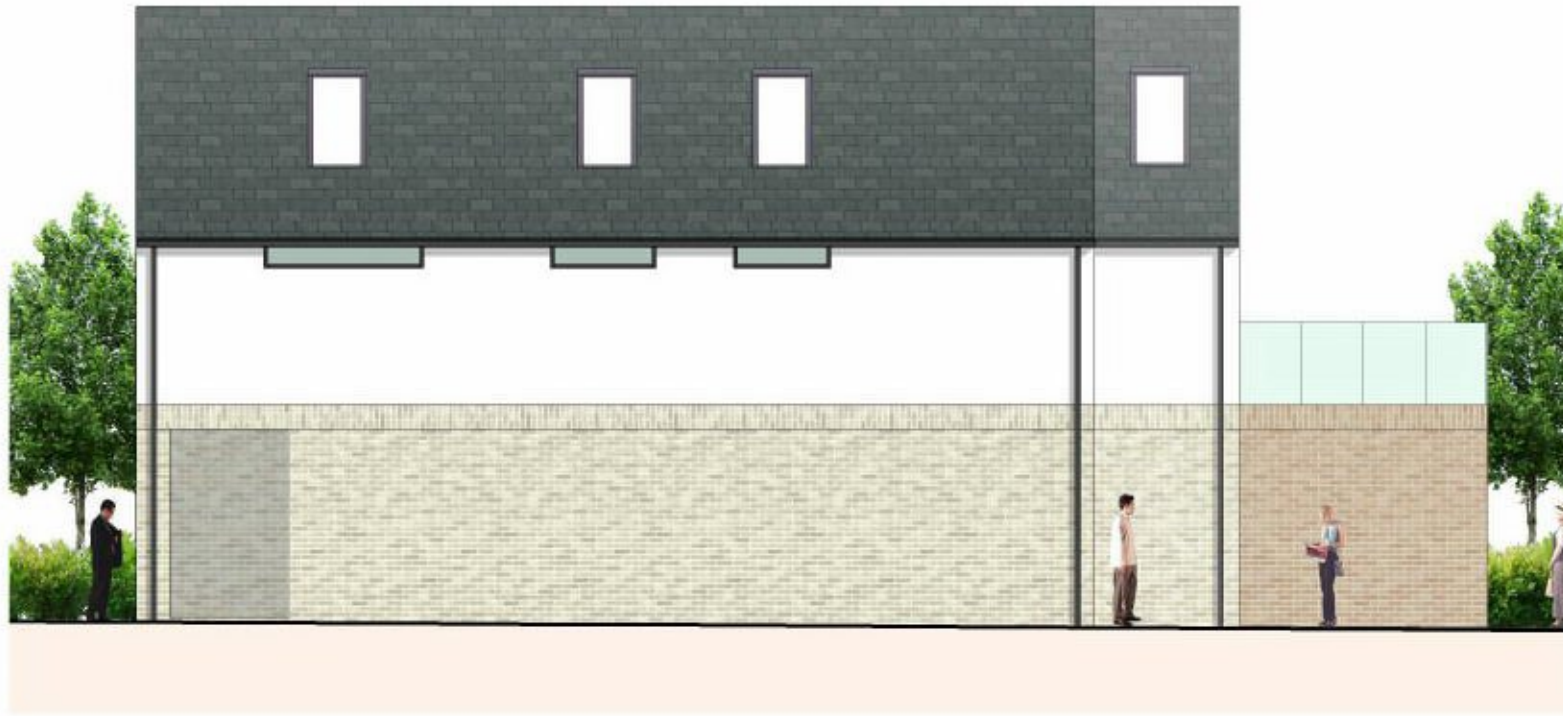
3 East Elevation 1 : 100