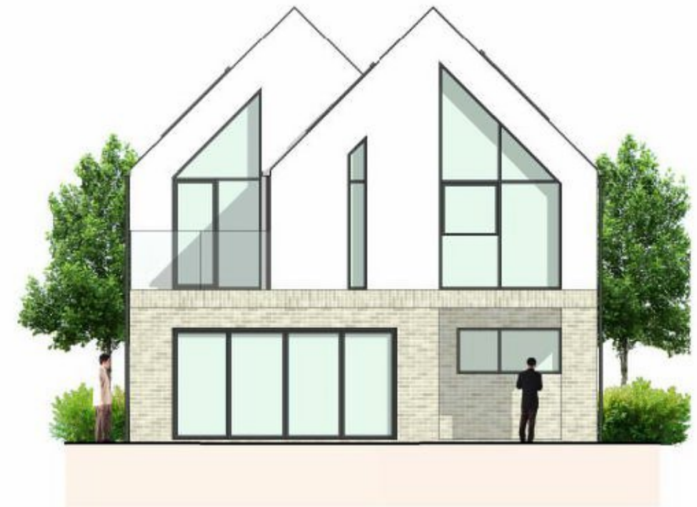
2 Rear Elevation 1 : 100

DO NOT SCALE FROM THIS DRAWING. WORK TO FIGURED DIMENSIONS ONLY. THIS DRAWING IS THE COPYRIGHT OF STANLEY BRAGG ARCHITECTS LTD AND SHOULD NOT BE REPRODUCED WITHOUT THEIR EXPRESS PERMISSION.