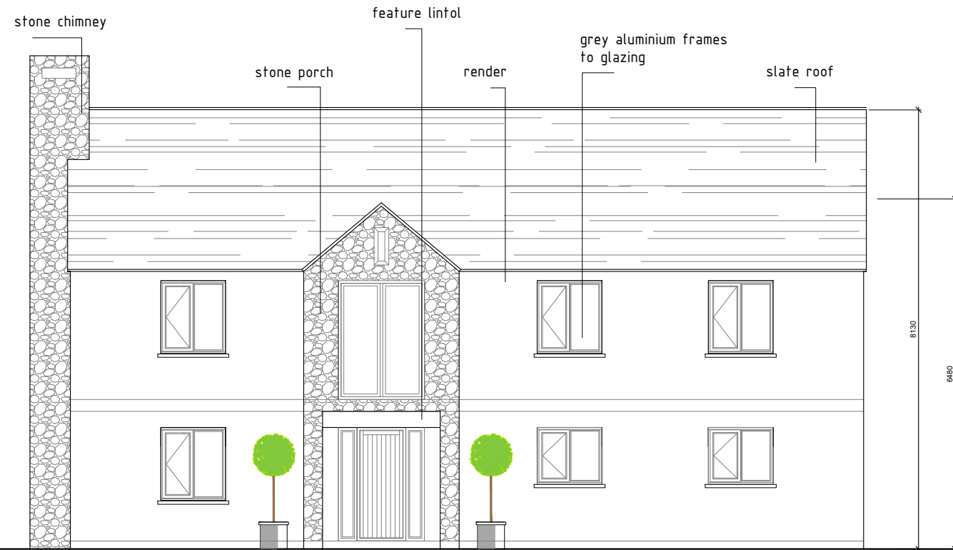
PROPOSED FRONT ELEVATION (WEST)