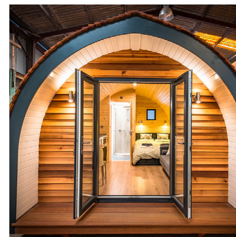
Aluminium Windows and Doors to recessed porch