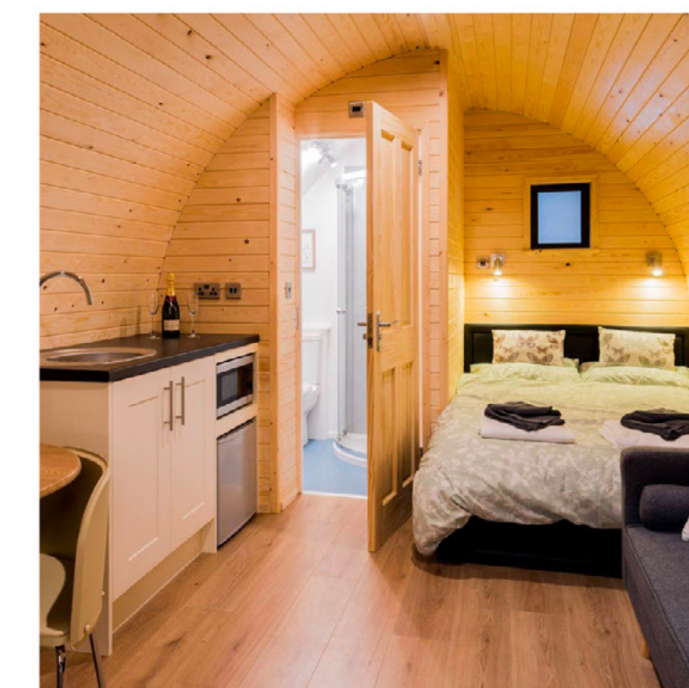
Internal Timber Clad Camping Pod