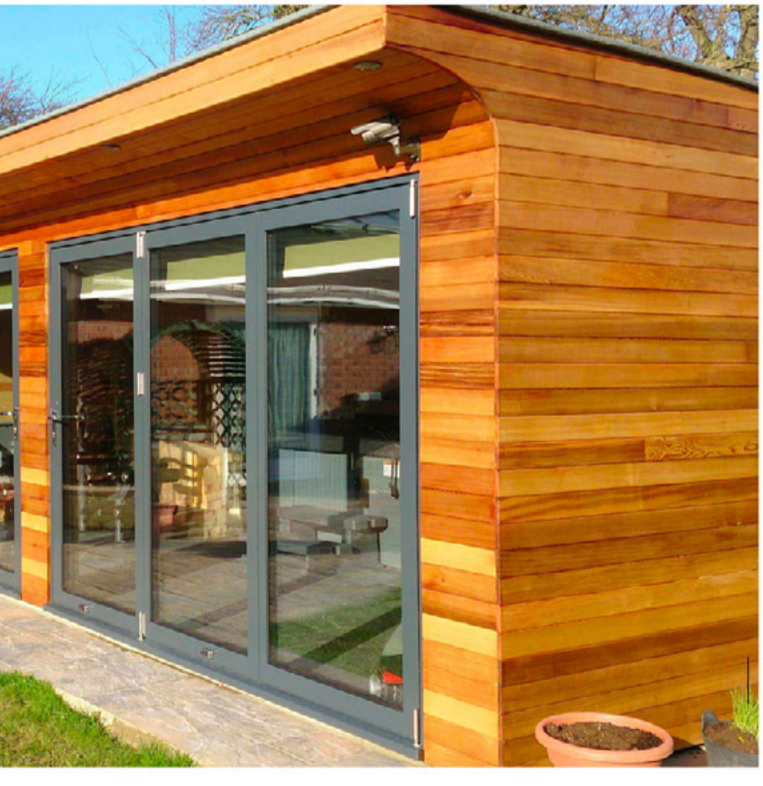
Aluminium Framed windows and doors