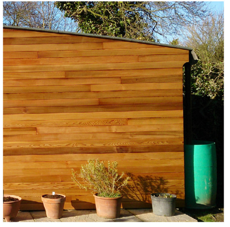
Cedar Cladding and dark grey roof membrane