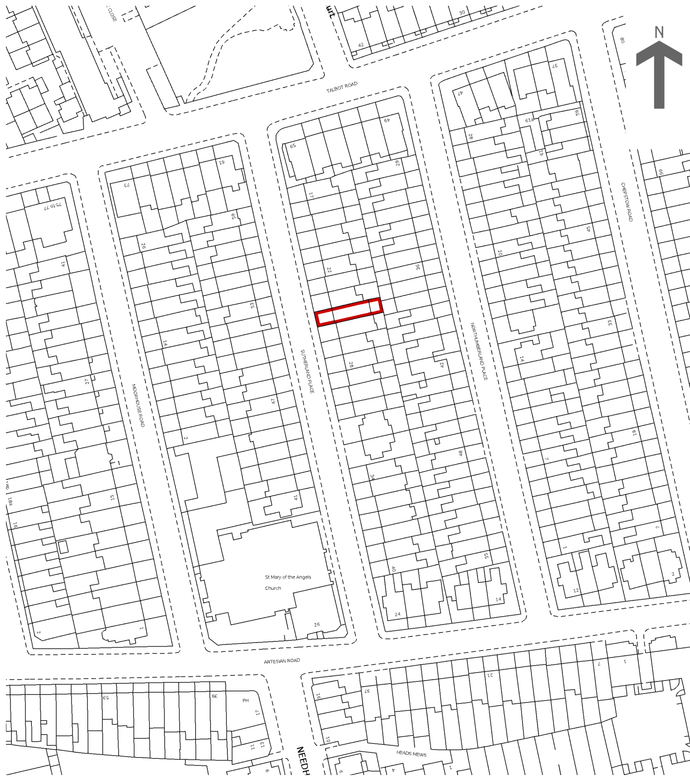
1 Existing Location Plan Scale: 1:1250

Disclaimers: All dimensions are to be confirmed on site. Zac Monro Architects takes no responsibility for any dimensions that are obtained by scaling this drawing. If no dimension is given, it is deemed to be the responsibility of the contractor to ascertain the dimension from site measurement before any fabrication takes place. Any discrepancies are to be brought to the attention of the Architect before the work is carried-out. All copyright for information included in this drawing remains with Zac Monro Architects.