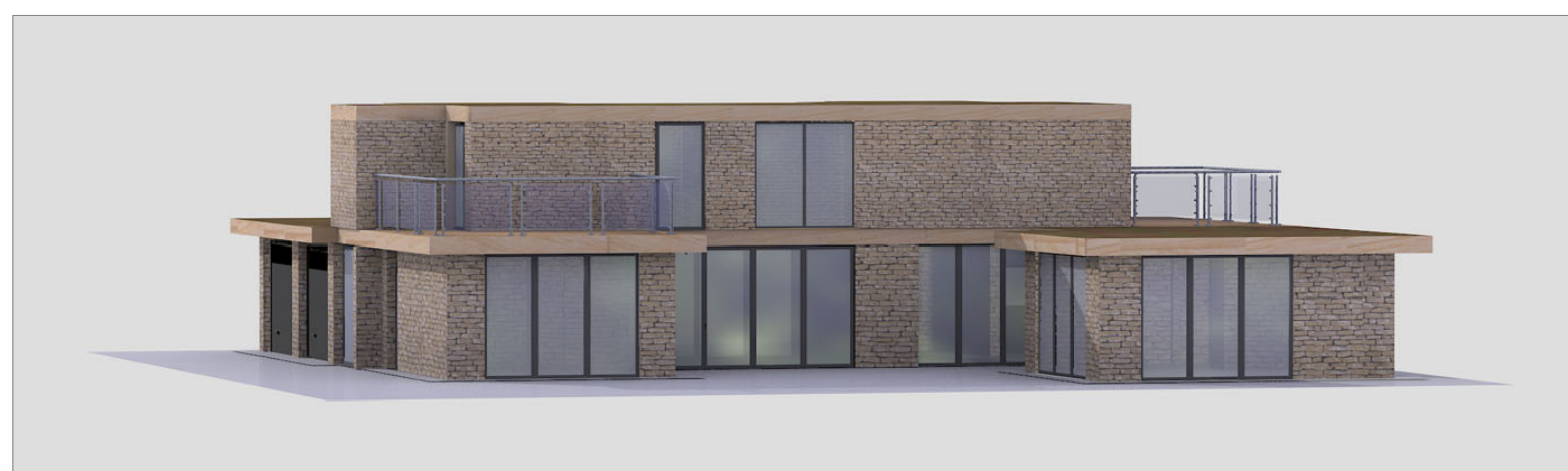
Perspective View From North West