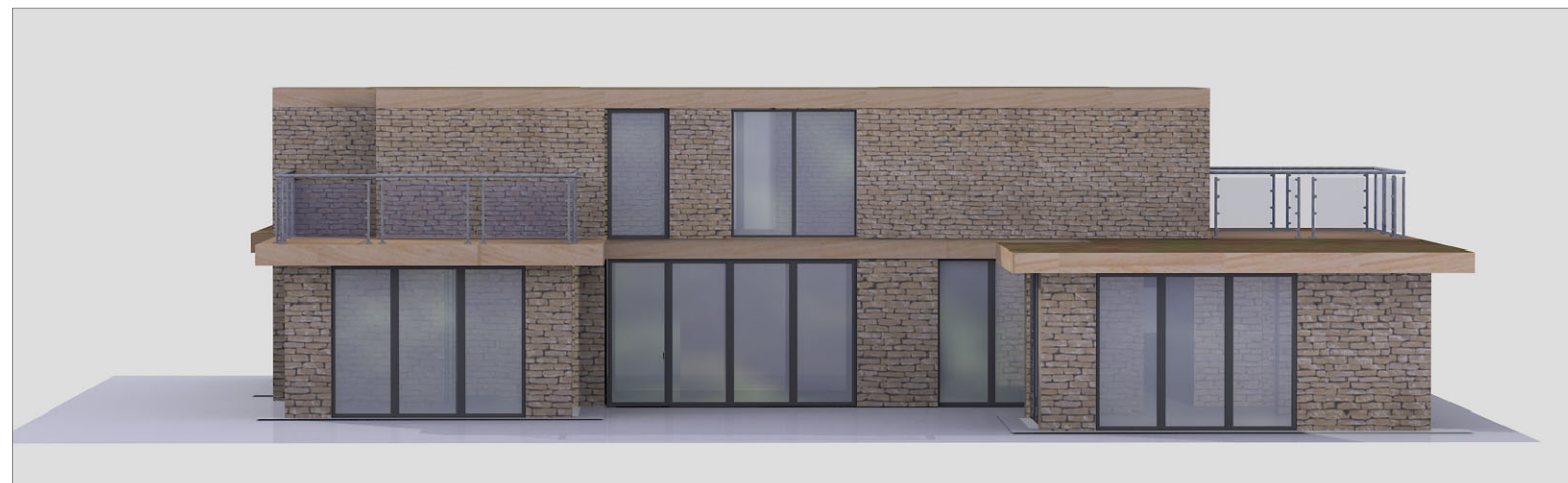
Perspective View From West