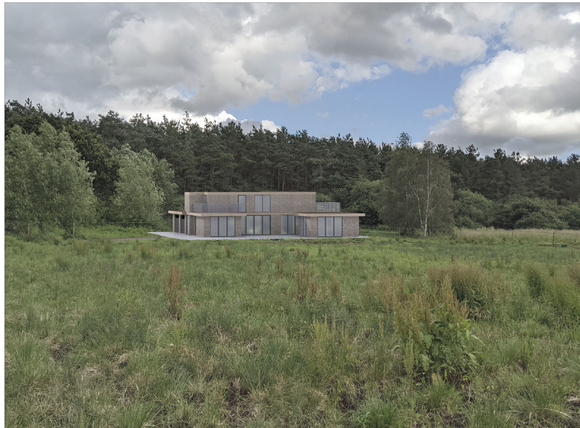
Proposed Photomontage From North West