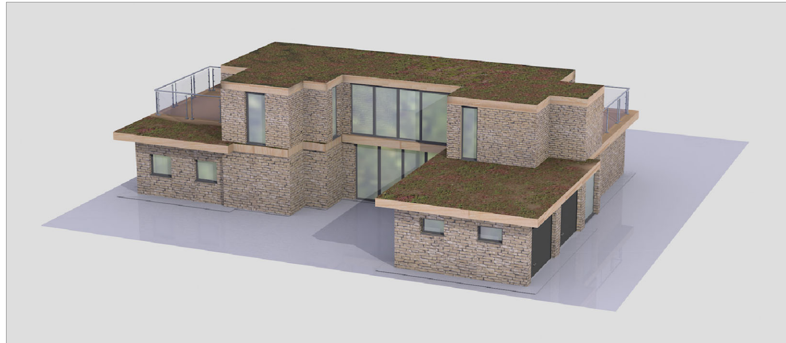
Perspective View From North East