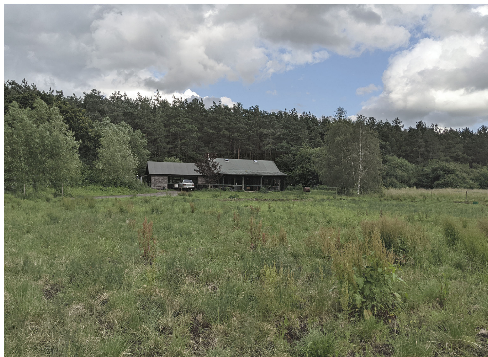
Photograph Of Existing Site From North West