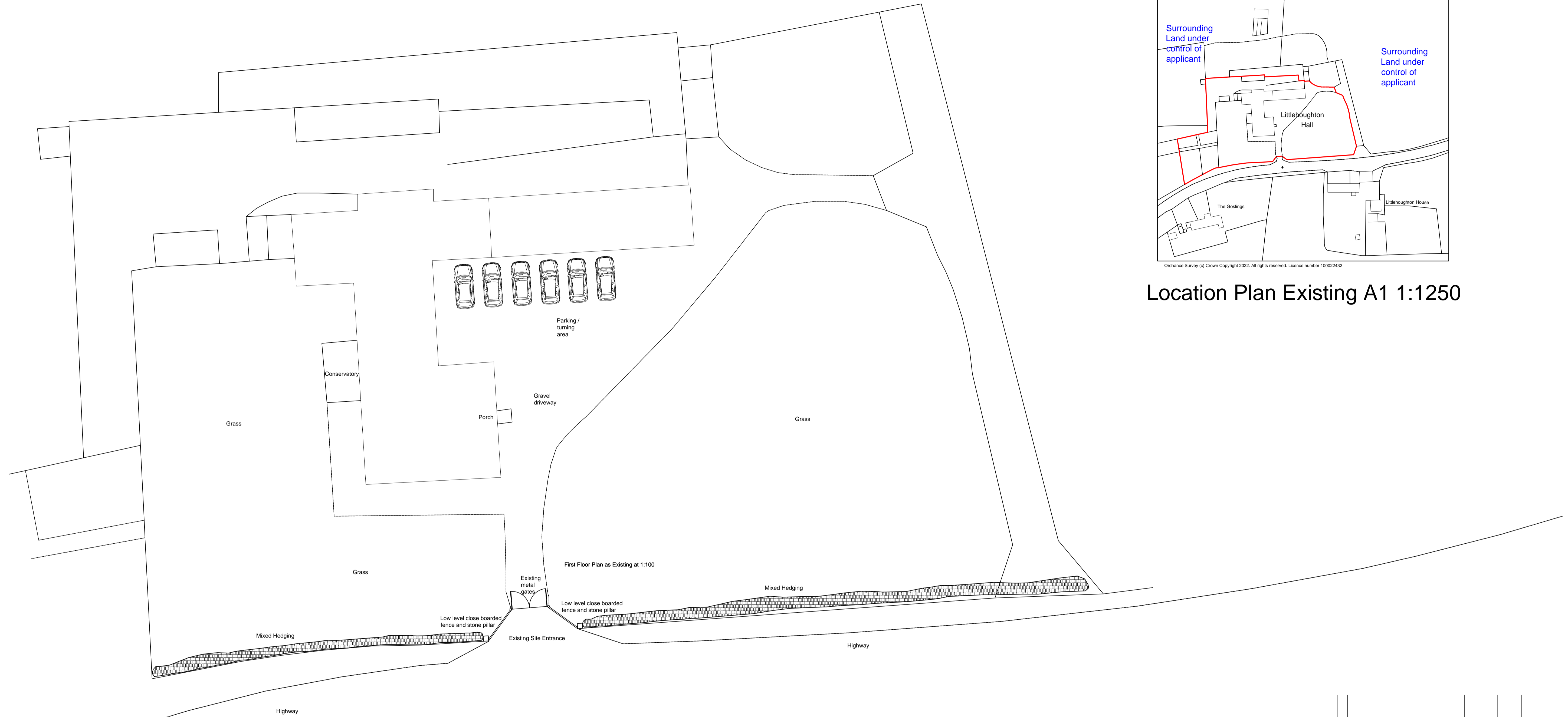
Site Plan as Existing A1 1:200